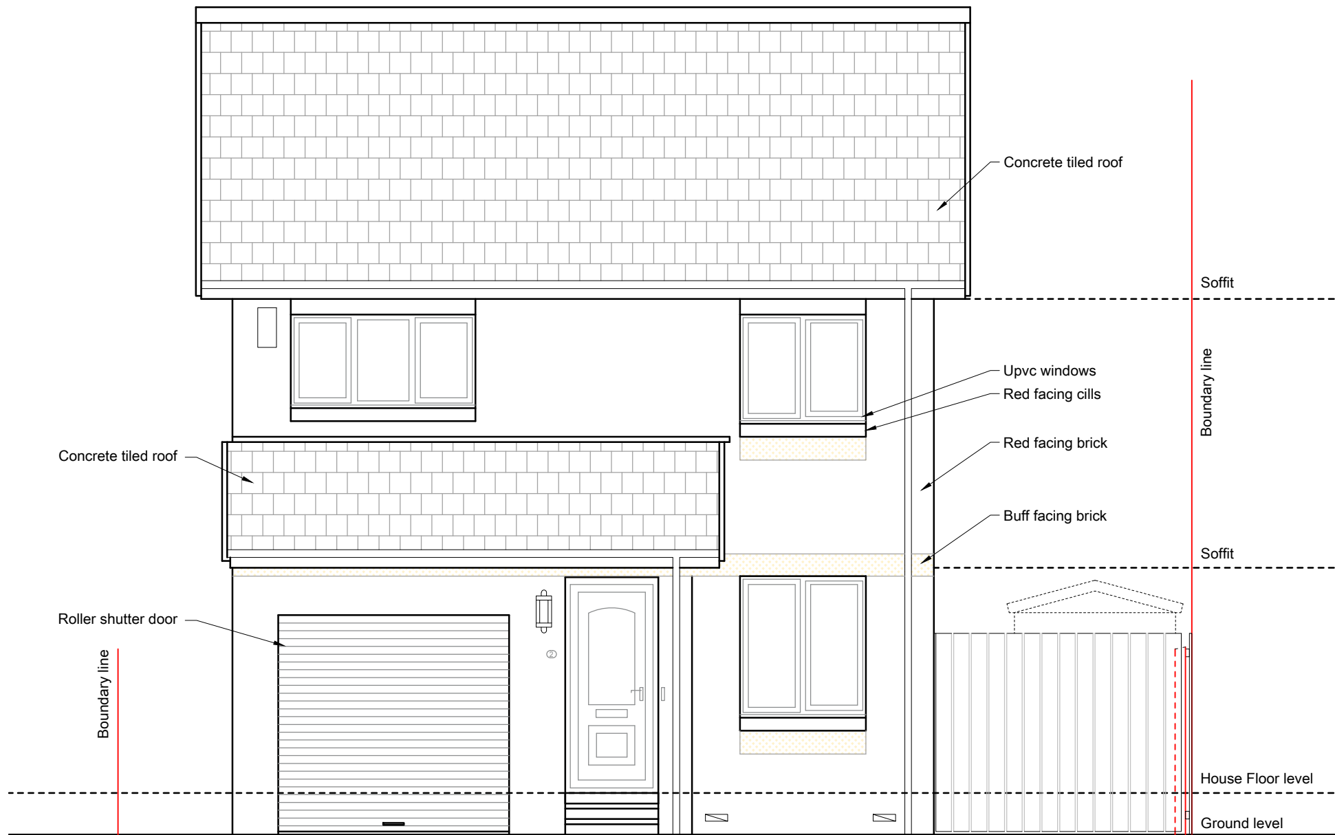
Existing south west front elevation Scale 1:50