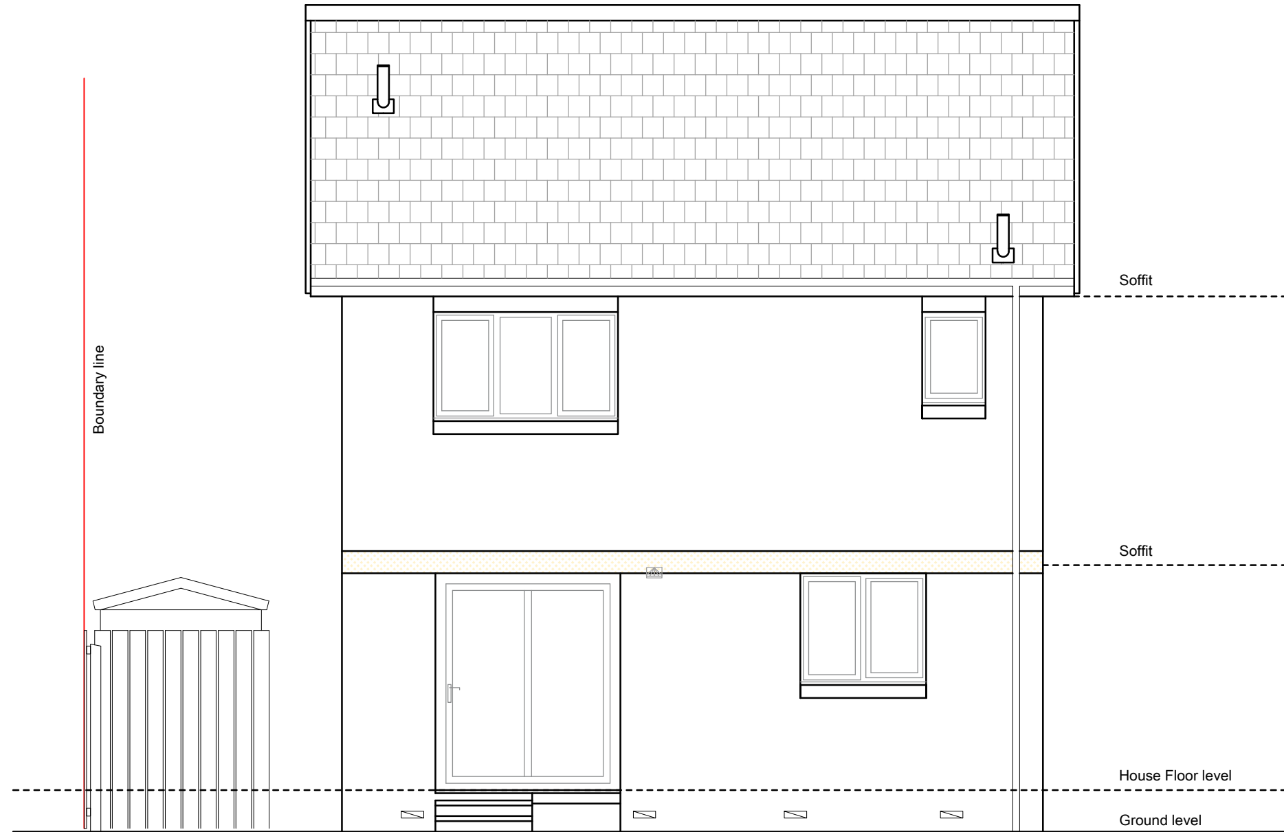
Existing & proposed north east rear elevation - No change Scale 1:50