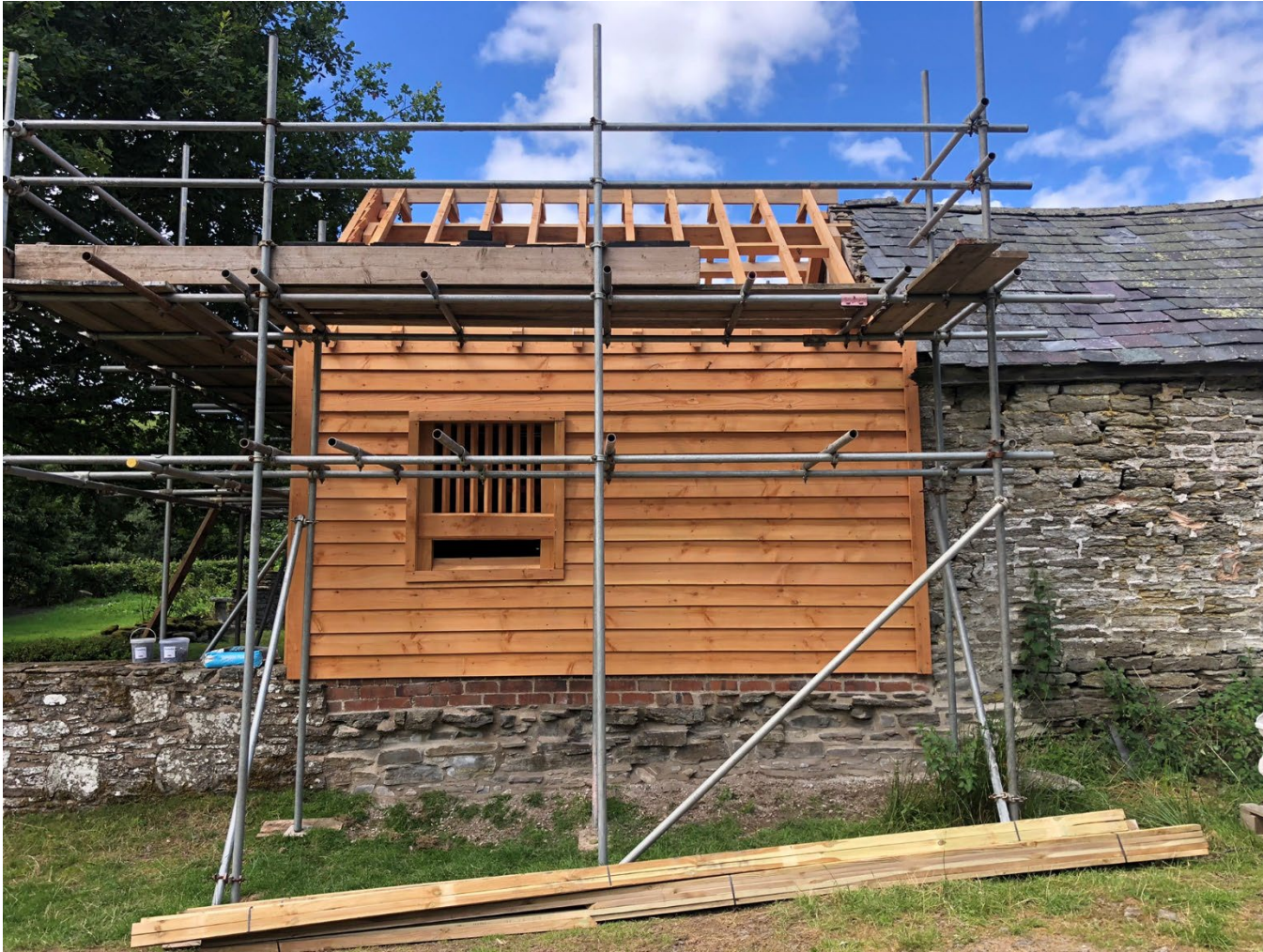
Stable Window : Elevation