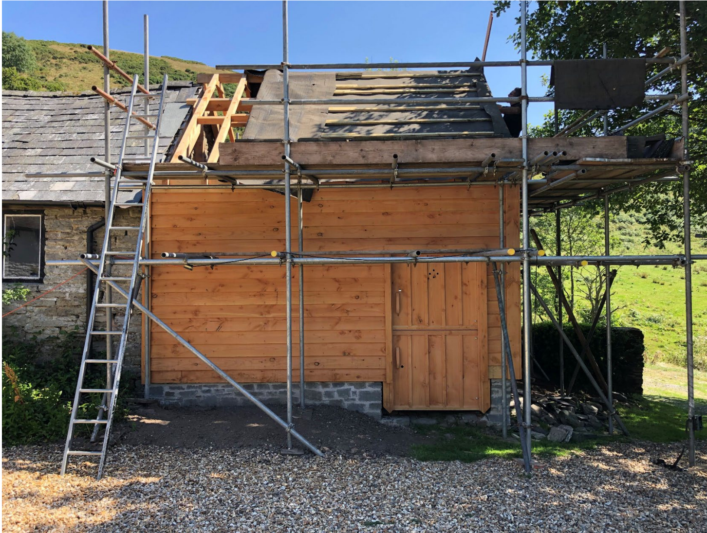
New Stable Main Door : Elevation