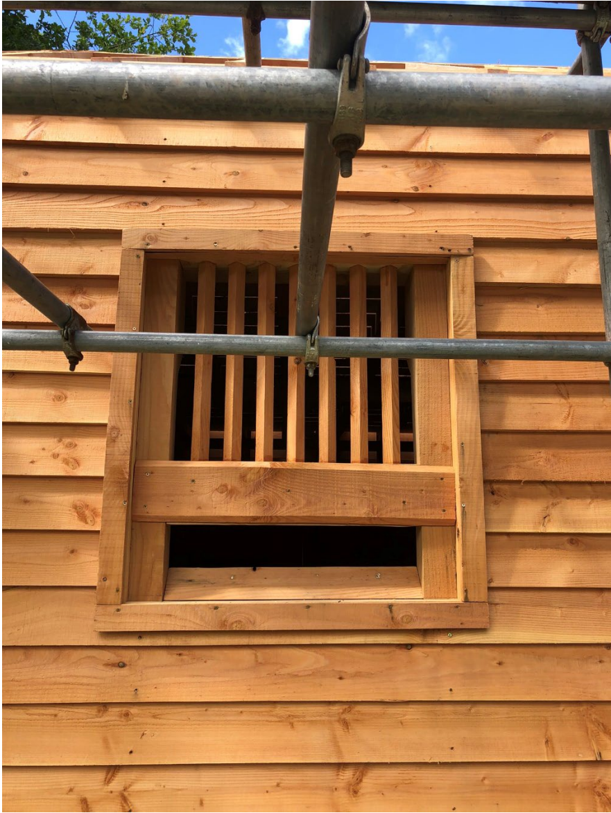
Stable Window : External