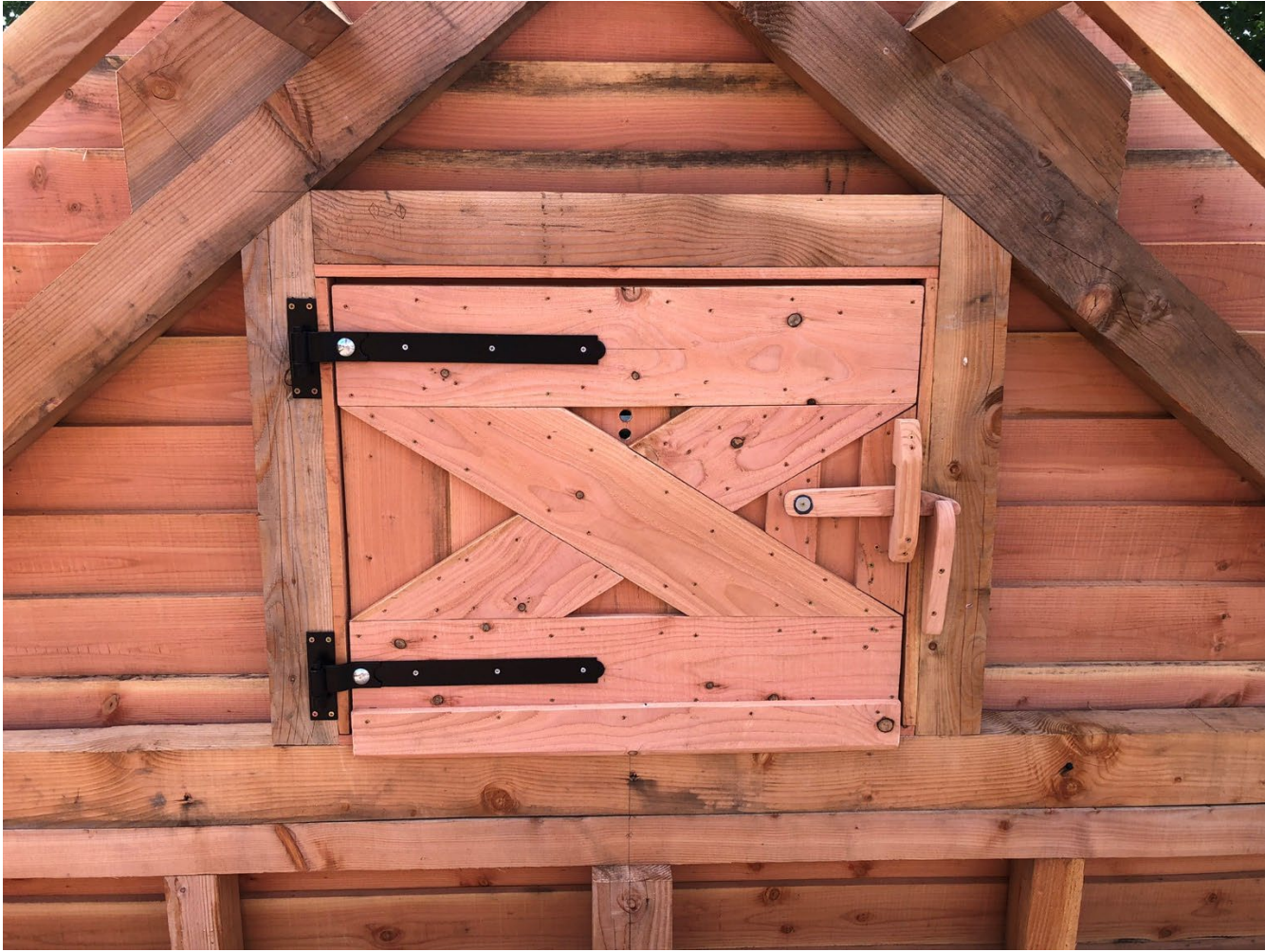
Loft Door : Internal