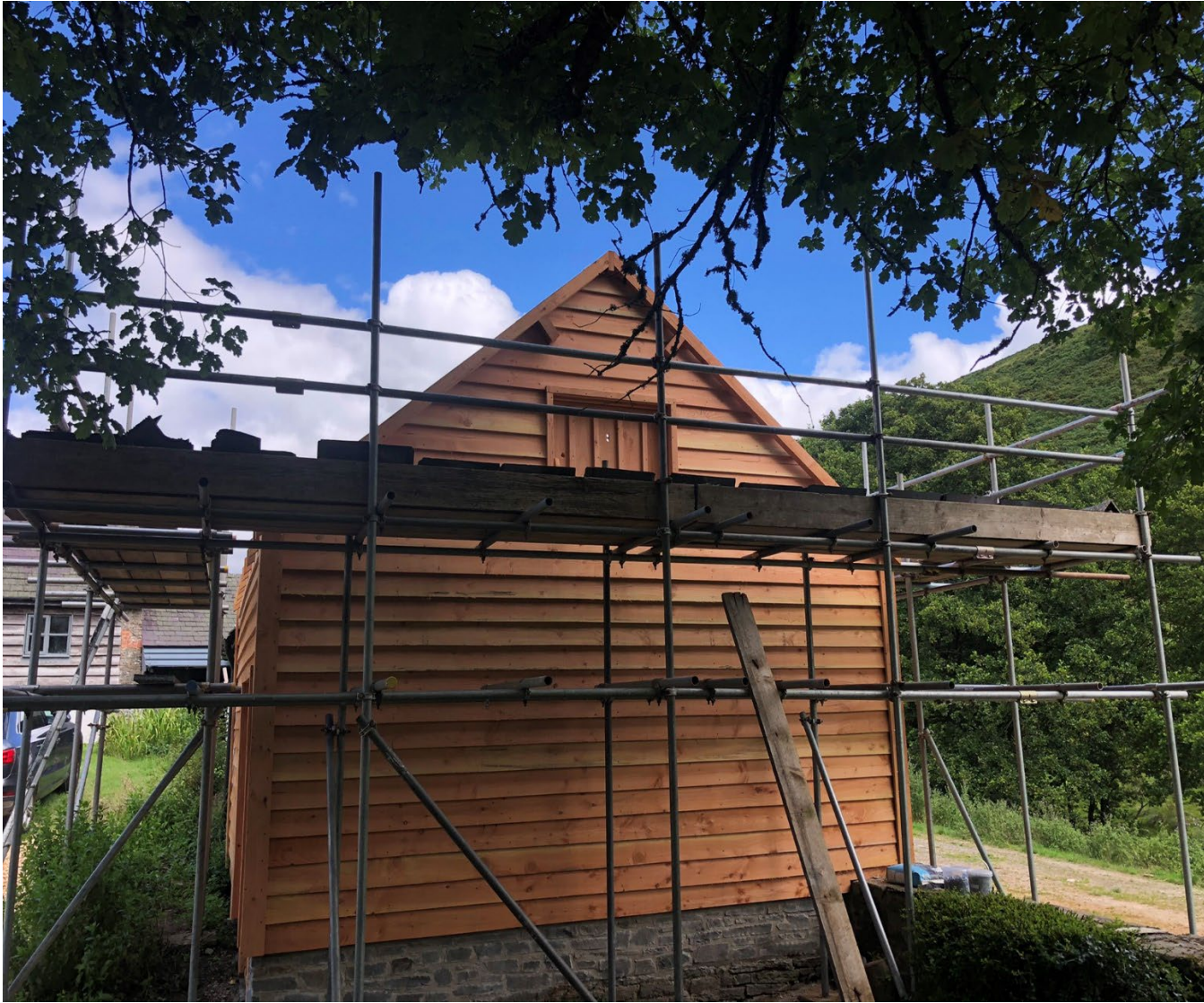
Loft Door : Elevation