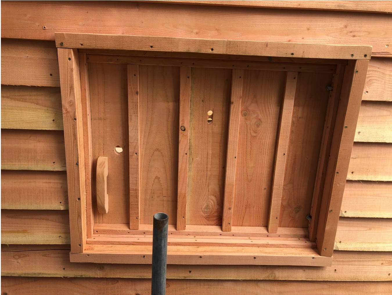
Loft Door : External