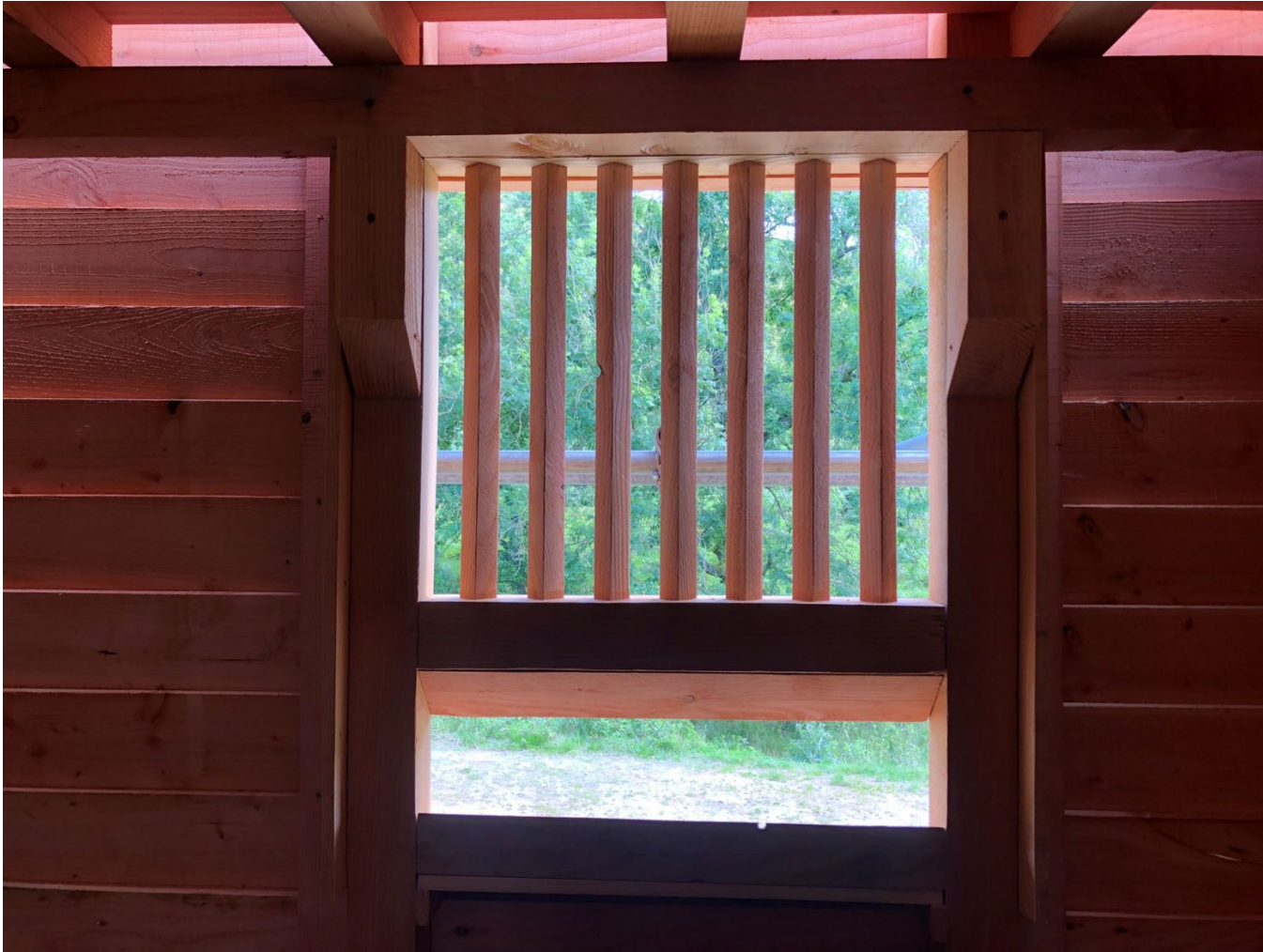
Stable Window : Internal