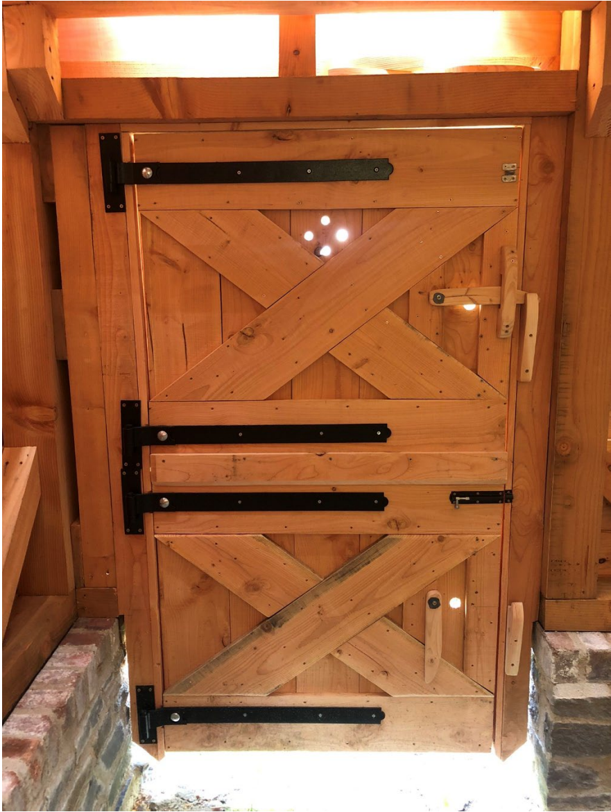
New Stable Main Door : Internal