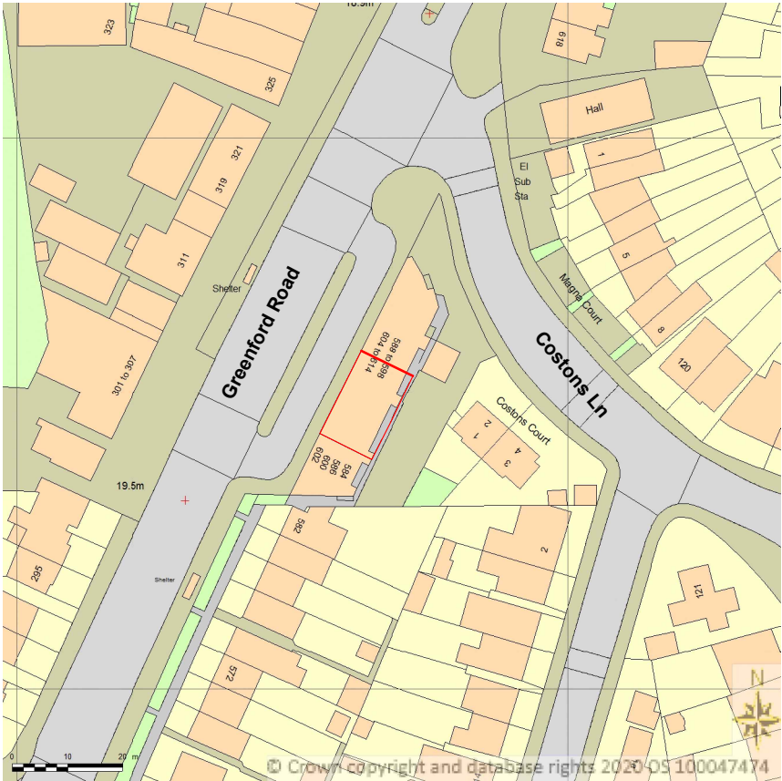
Location Plan@ 1:1250

Installation of Compressor Units on the rear elevation wall