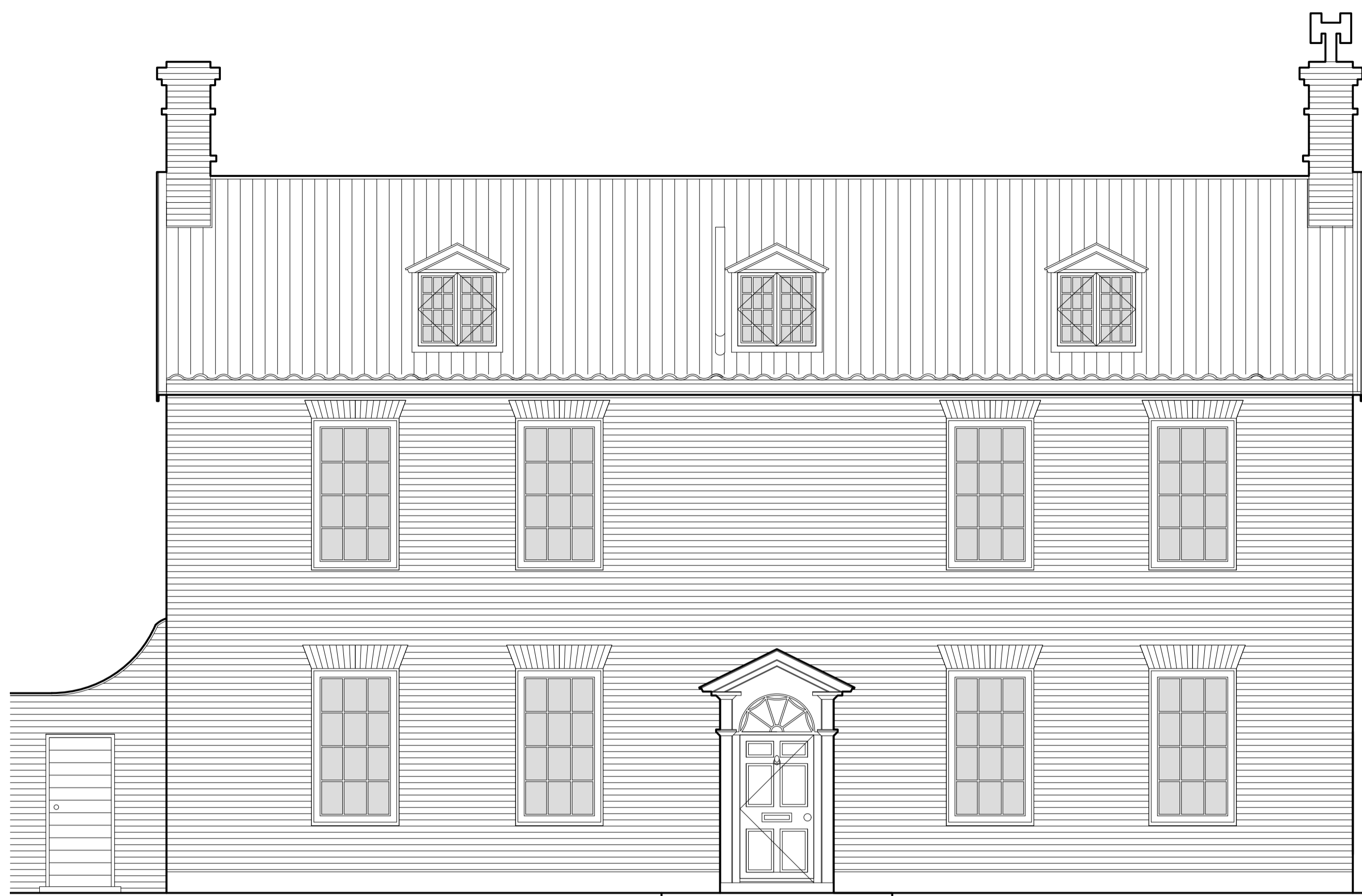
PROPOSED SOUTH ELEVATION @ 1:50 SCALE