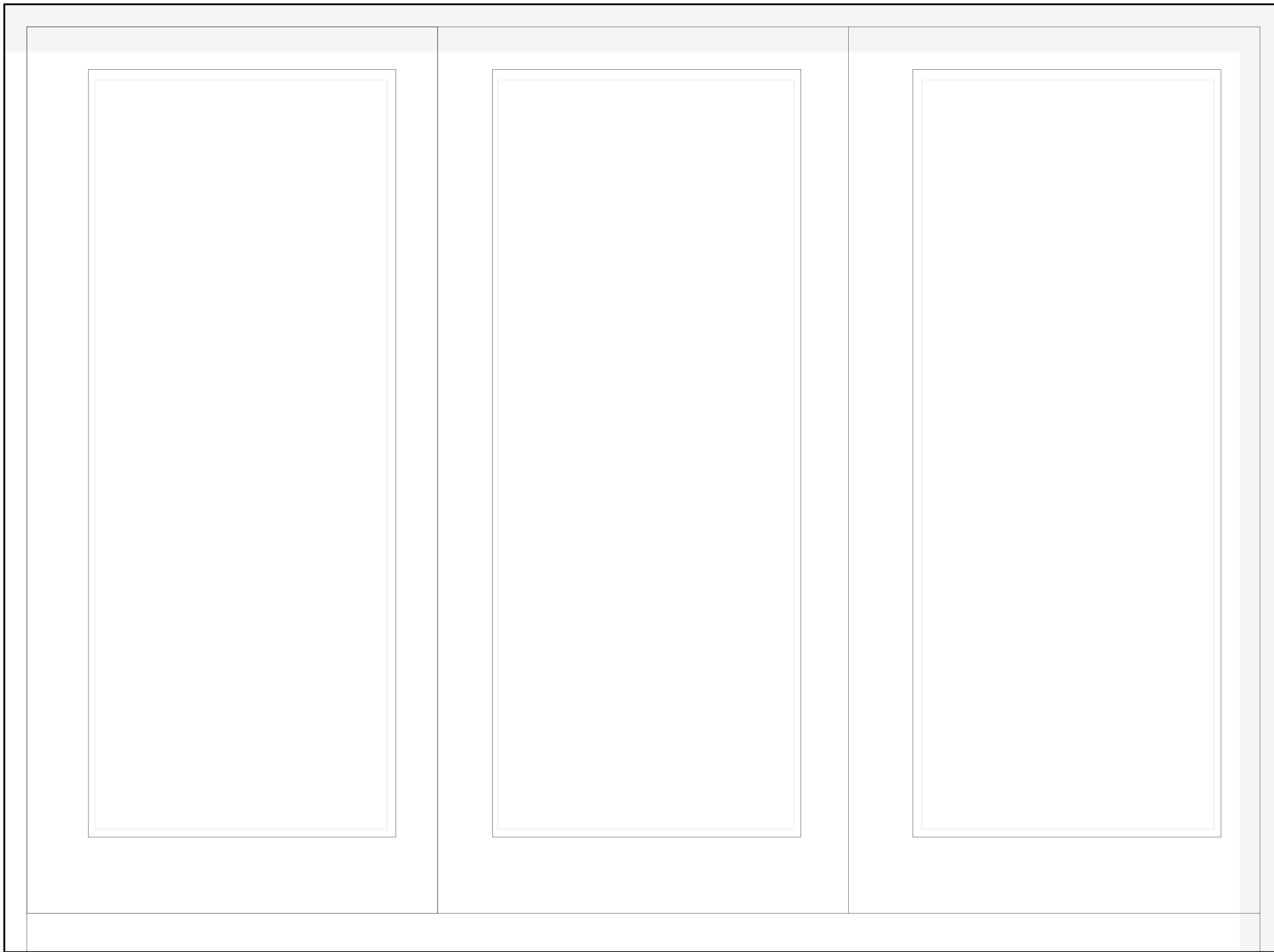
Proposed new door - D01