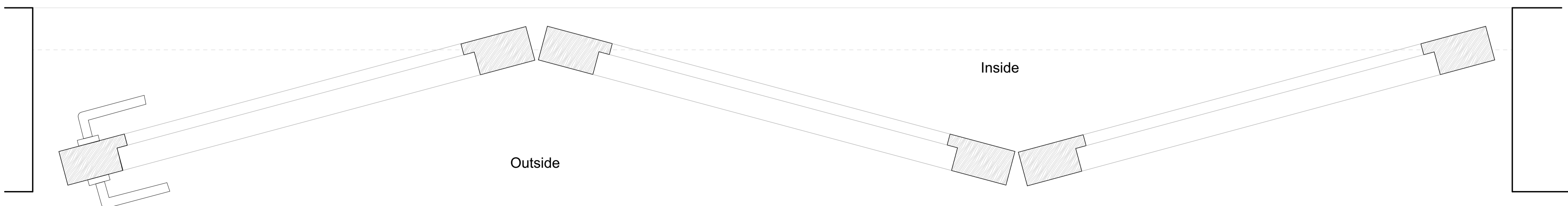
Proposed new door plan - D01