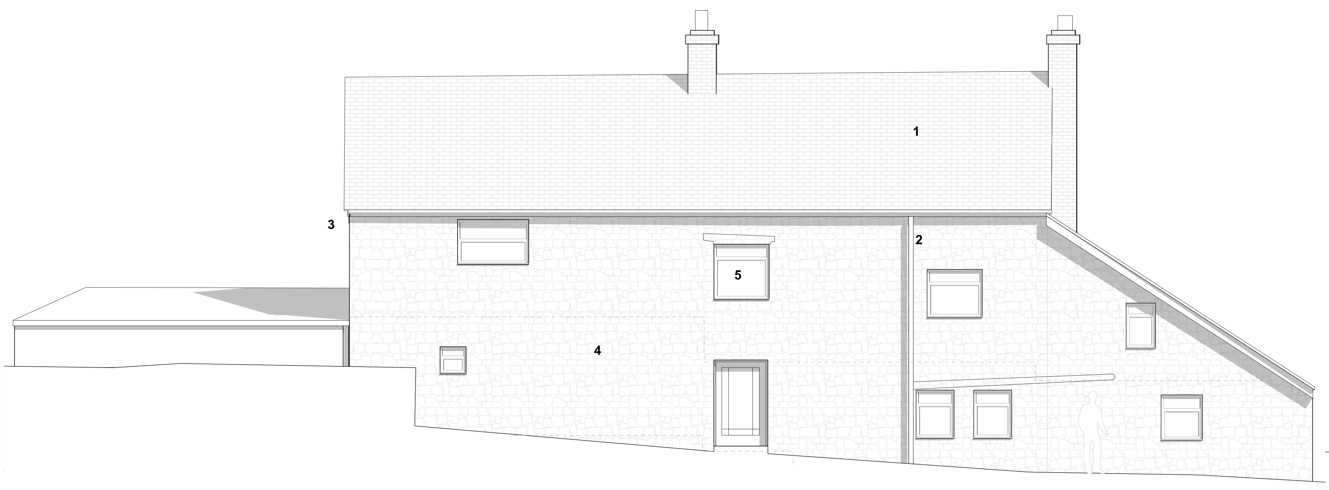
Existing North East Elevation @ 1:50