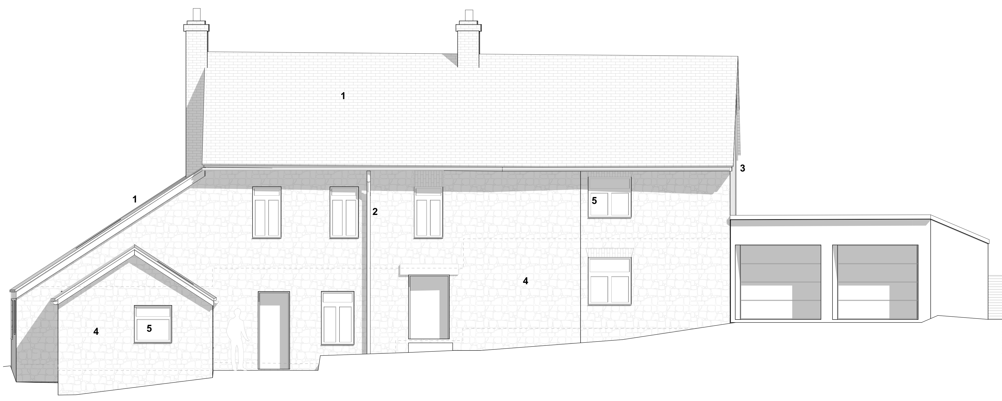
Existing South West Elevation @ 1:50