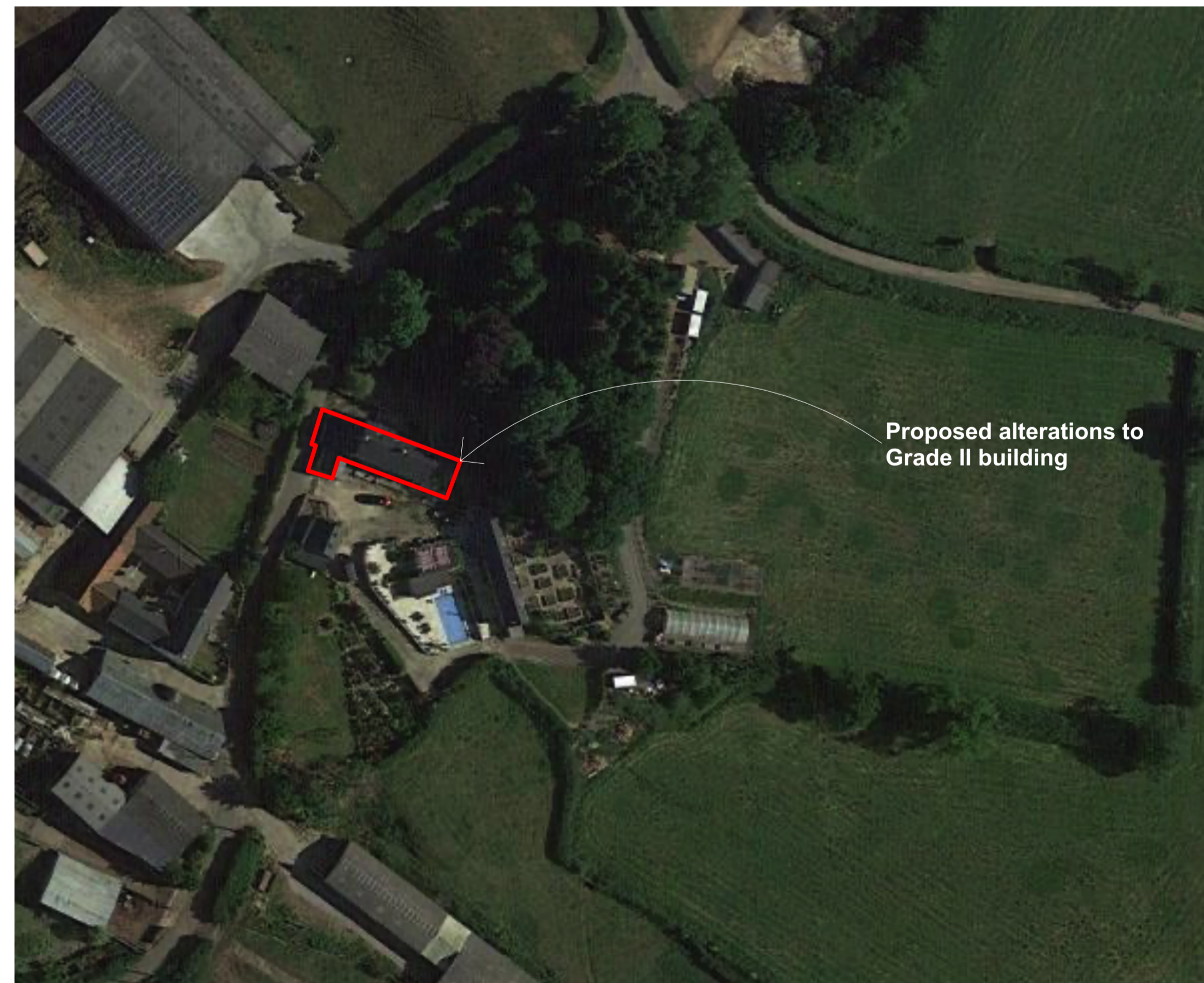
Proposed alterations to Grade II building

© Crown copyright 2022 Ordnance Survey 100022432