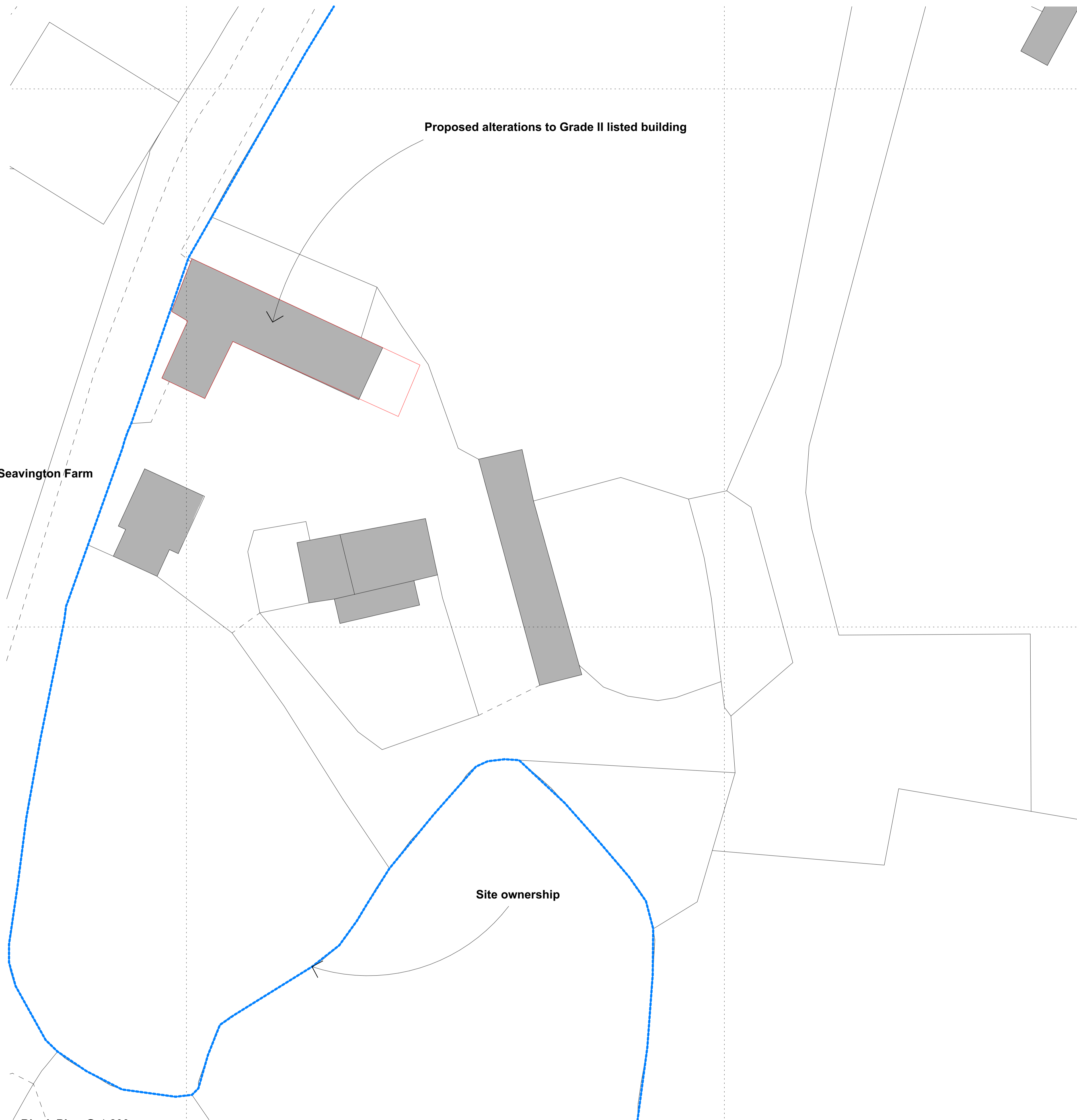
Block Plan @ 1:200