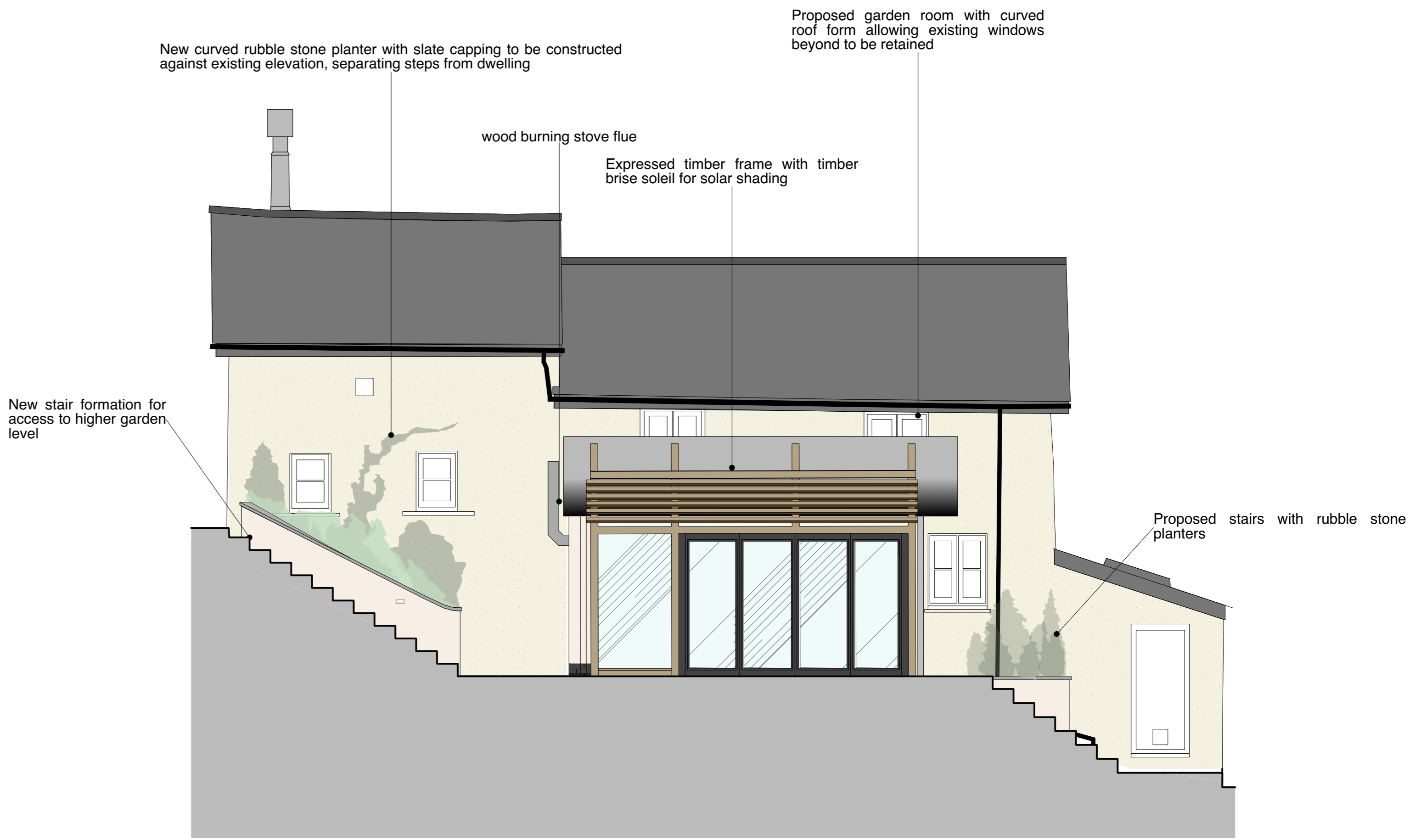
Proposed South West Elevation

New curved steps from higher terrace with paved finish to match New rubble stone dwarf walling with slate capping to perimeter of higher terrace