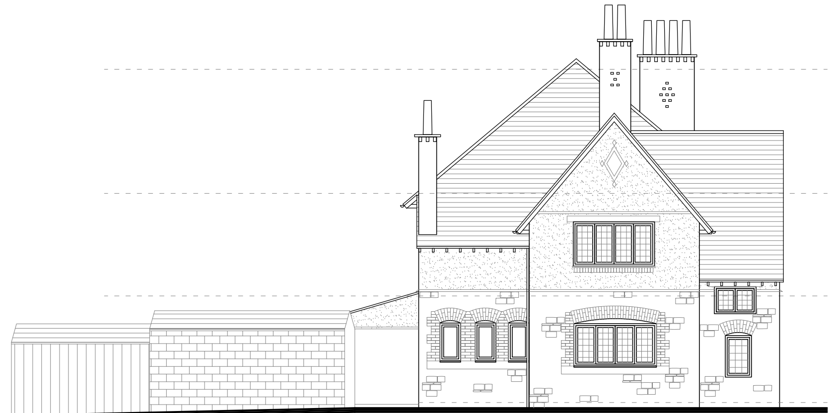
EXISTING SOUTH EAST ELEVATION