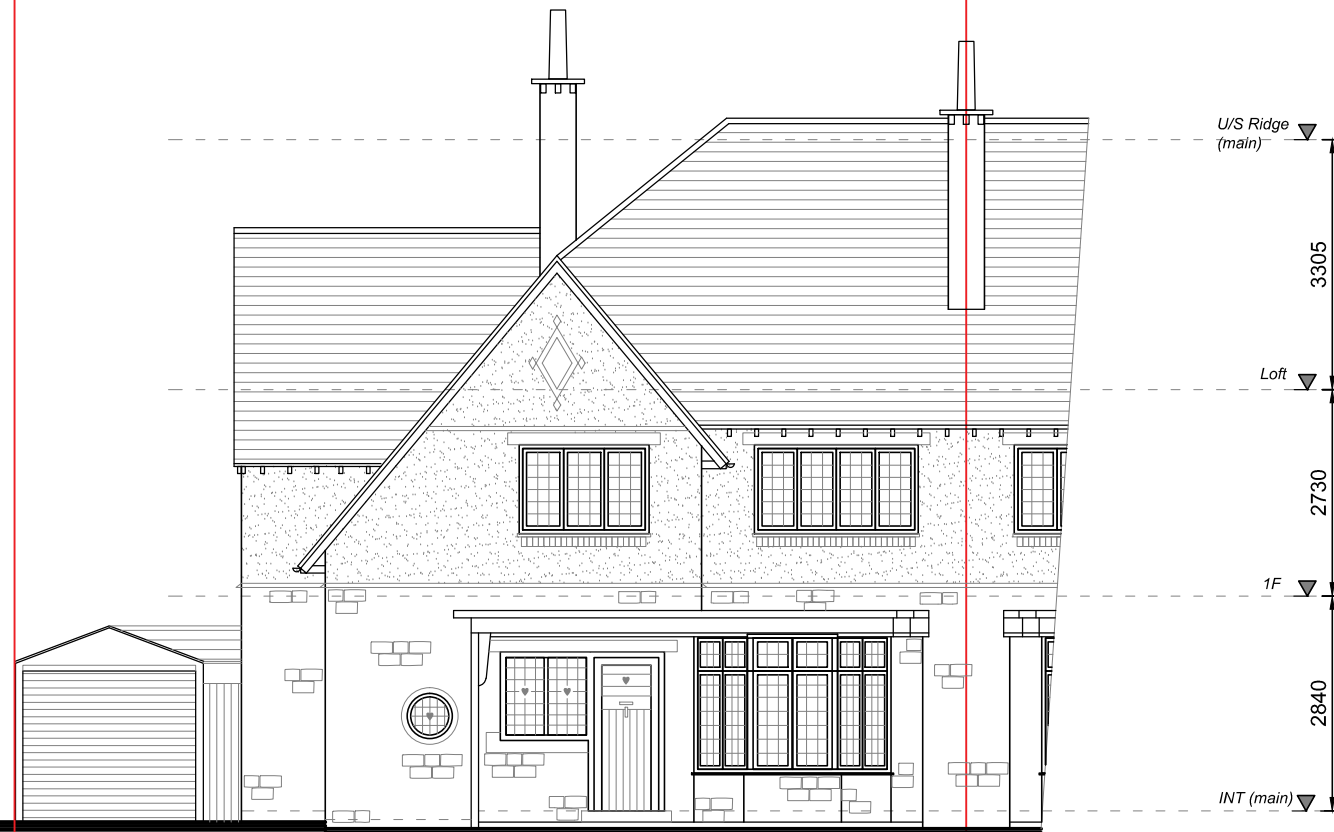
EXISTING NORTH EAST ELEVATION