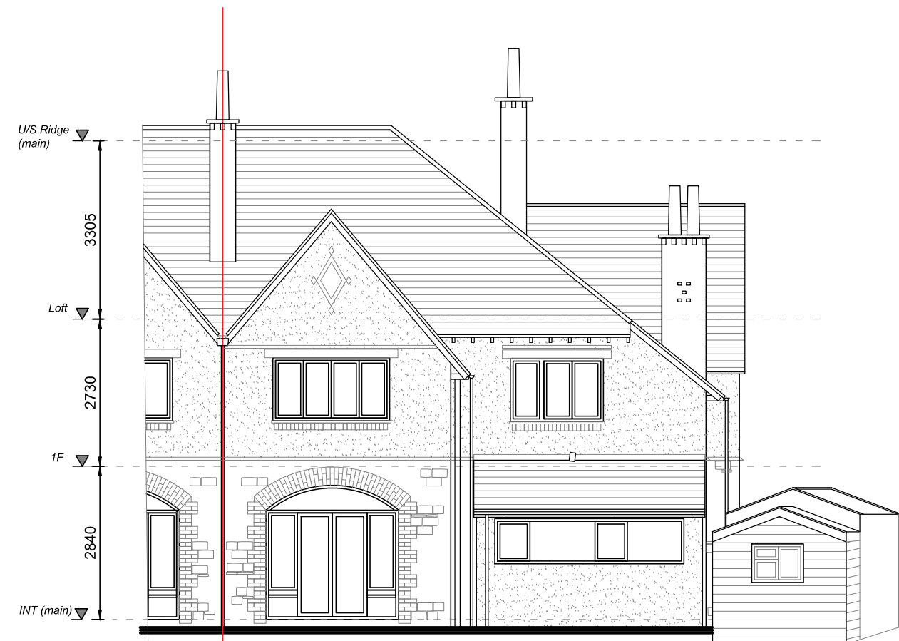
EXISTING SOUTH WEST ELEVATION