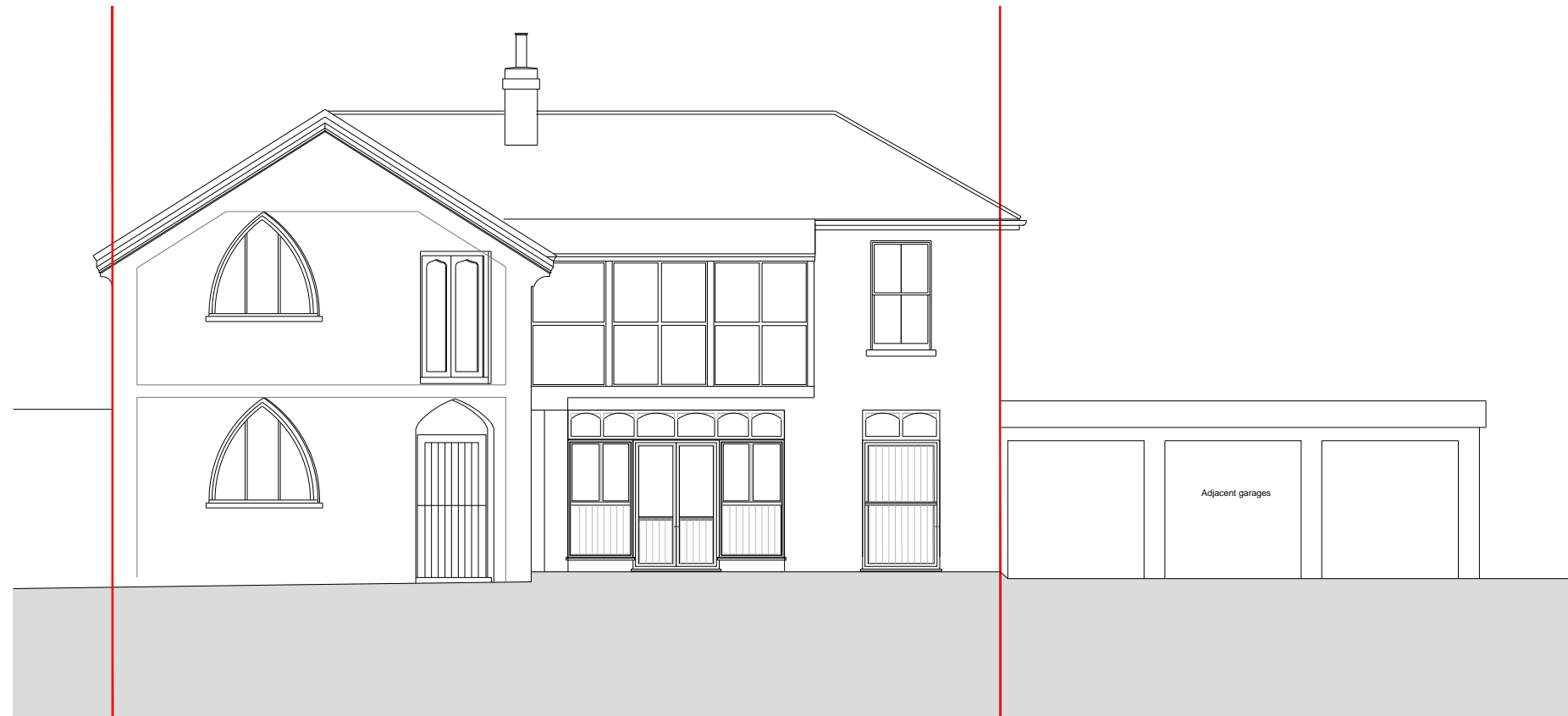
Front South Elevation