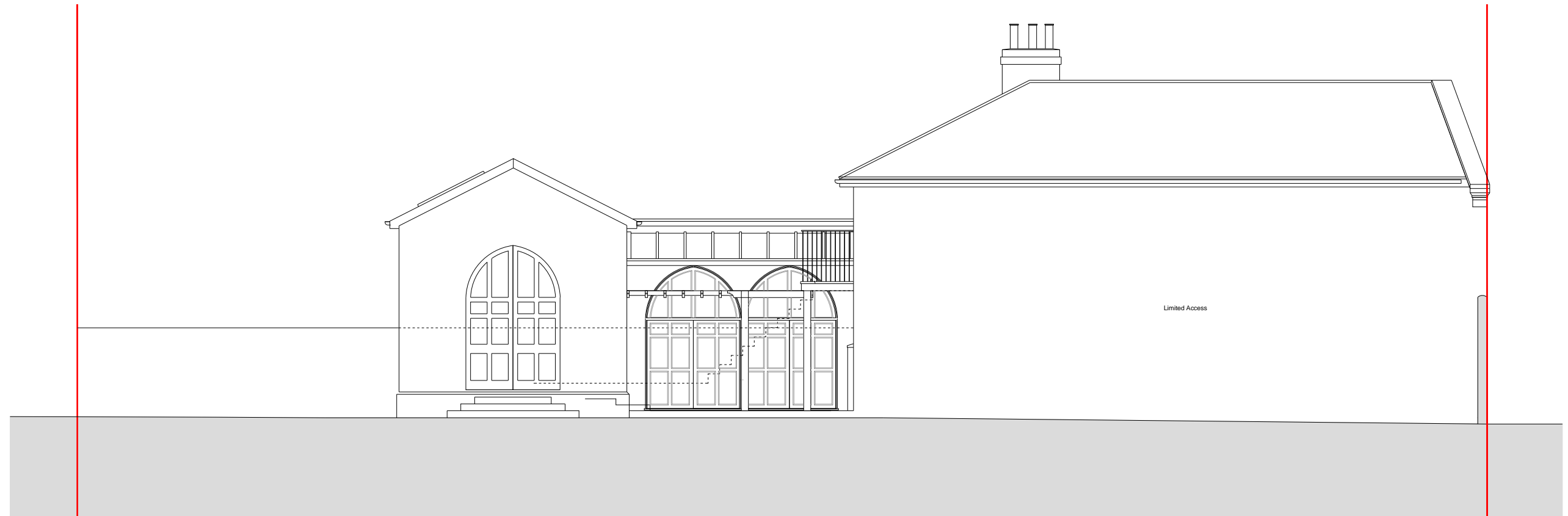
Side West Elevation