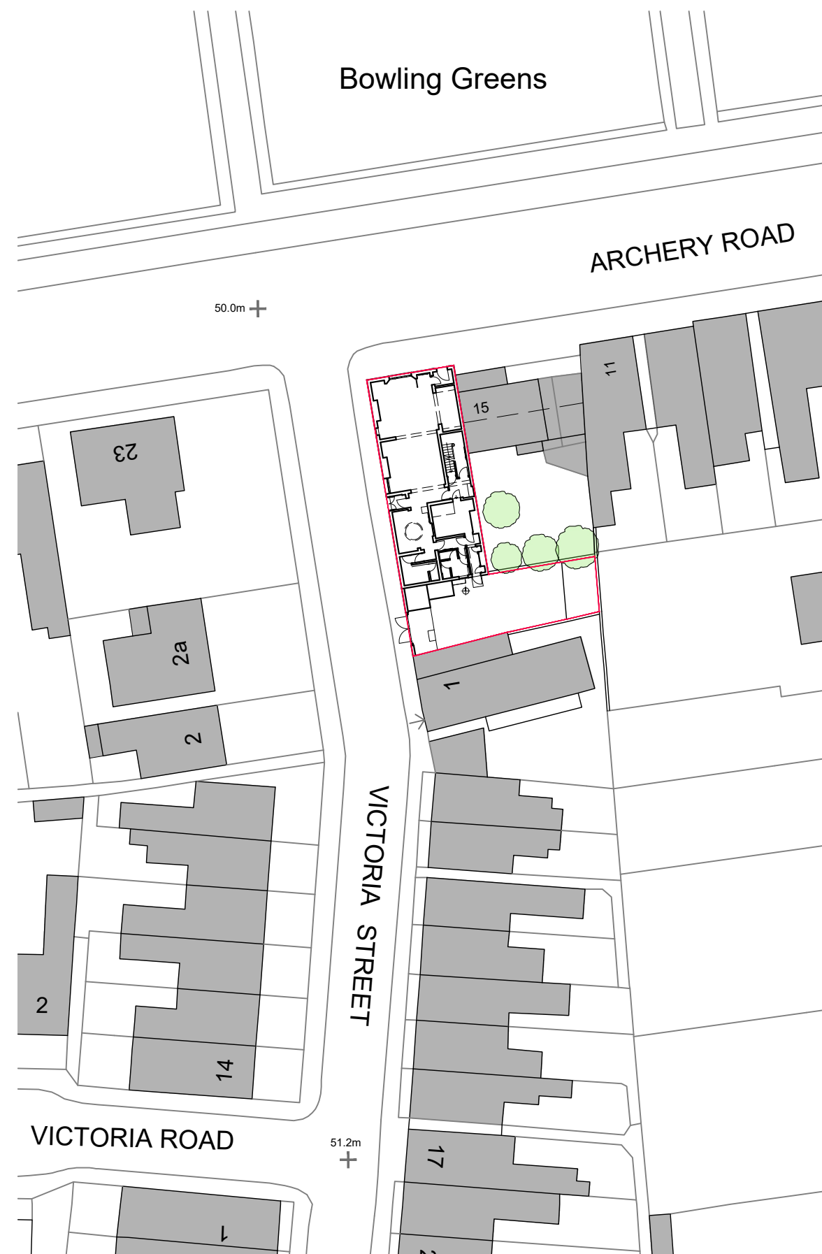
BLOCK PLAN AS EXISTING