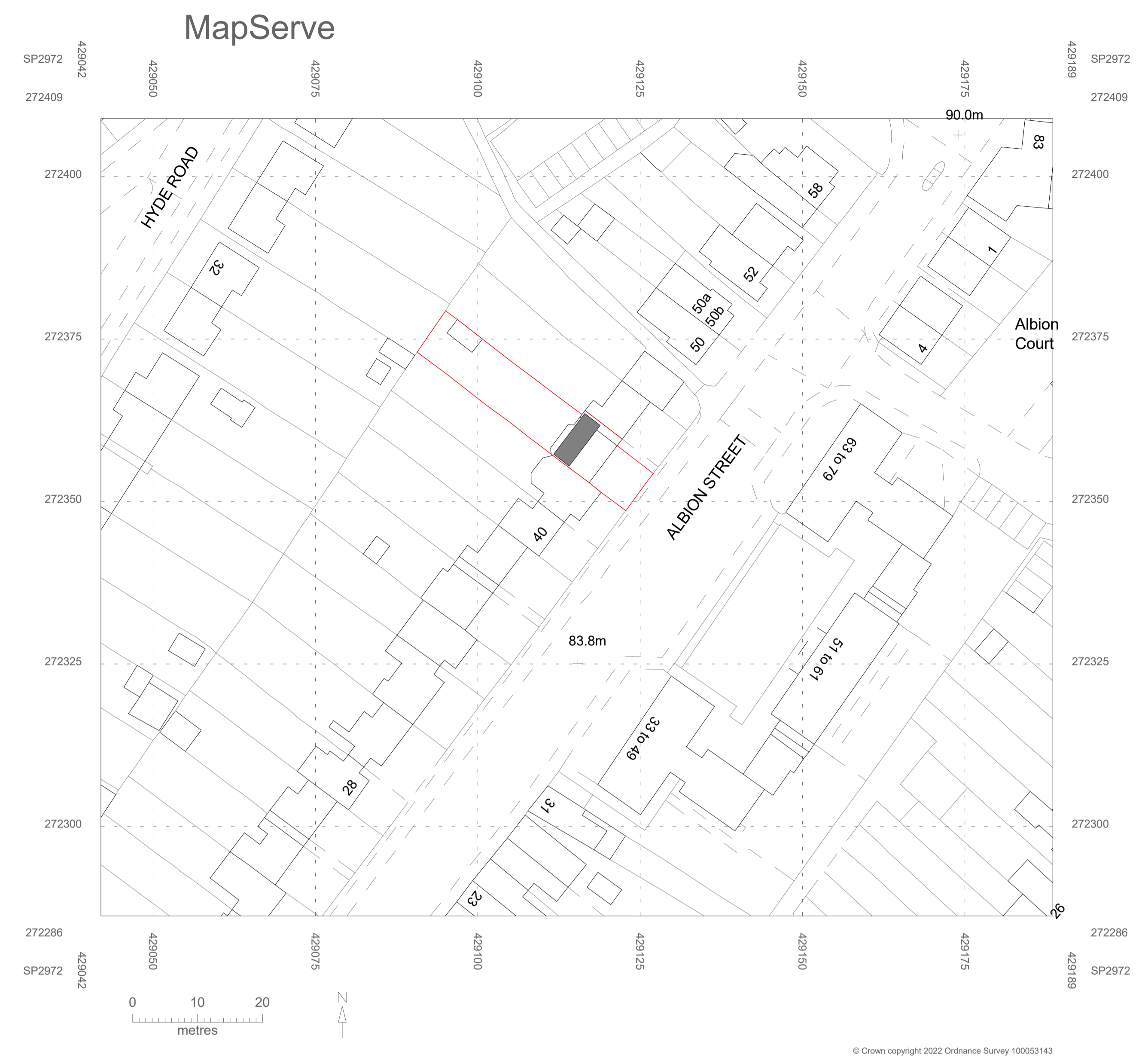
Site 1 : 500