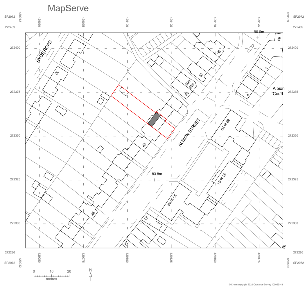
Location Plan 1 : 1250