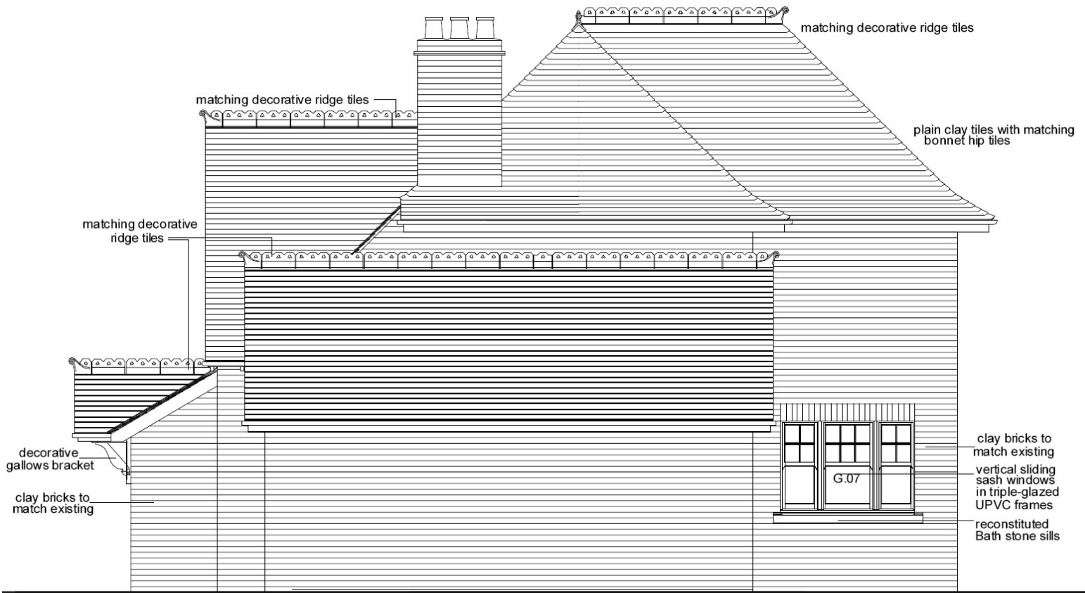
SOUTH WEST SIDE ELEVATION