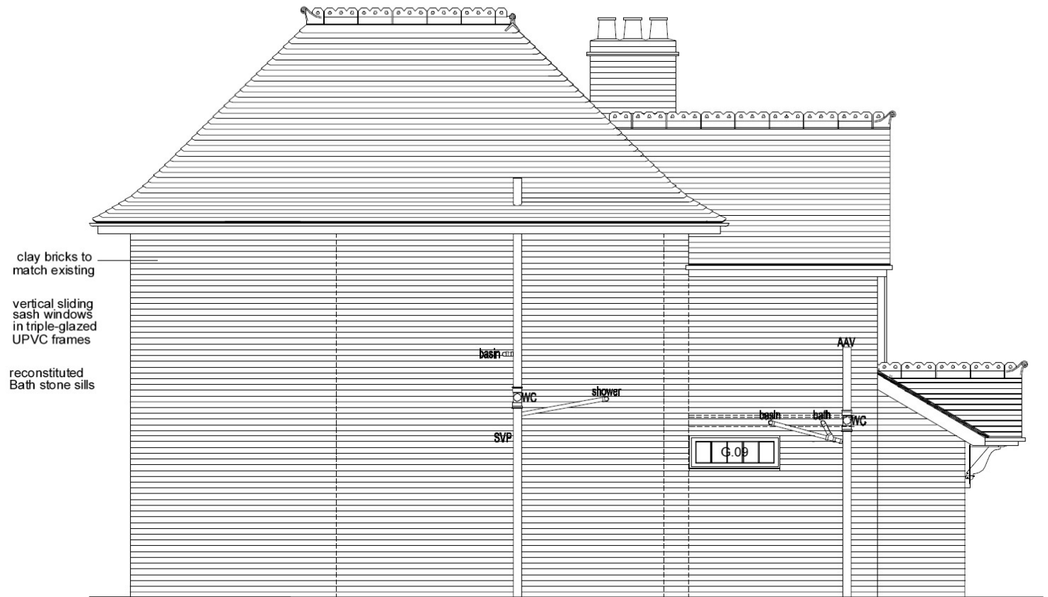
NORTH EAST SIDE ELEVATION