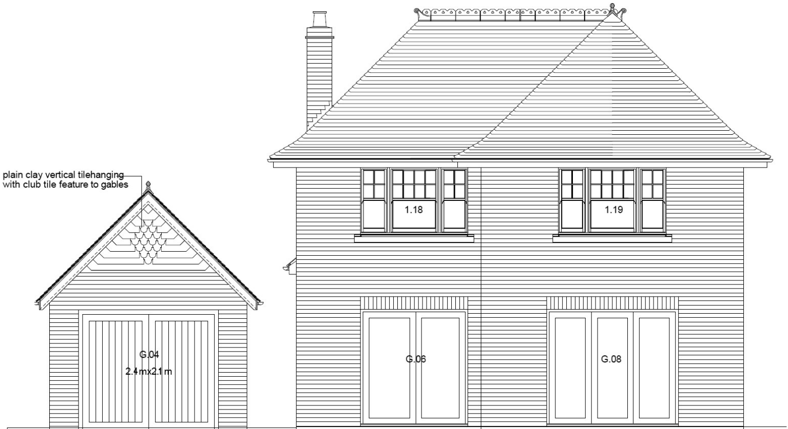
SOUTH EAST REAR ELEVATION