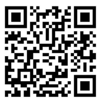
GOOGLE MAPS QR CODE

GOOGLE MAPS - https://goo.gl/maps/T3z8A6cga1WA8Qn2g7