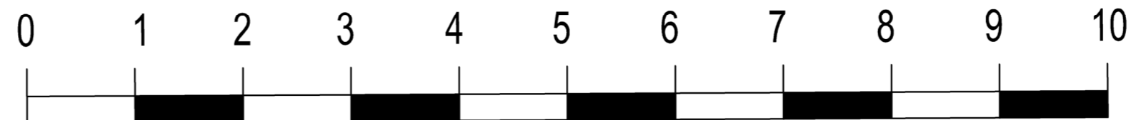
10 metre scale bar