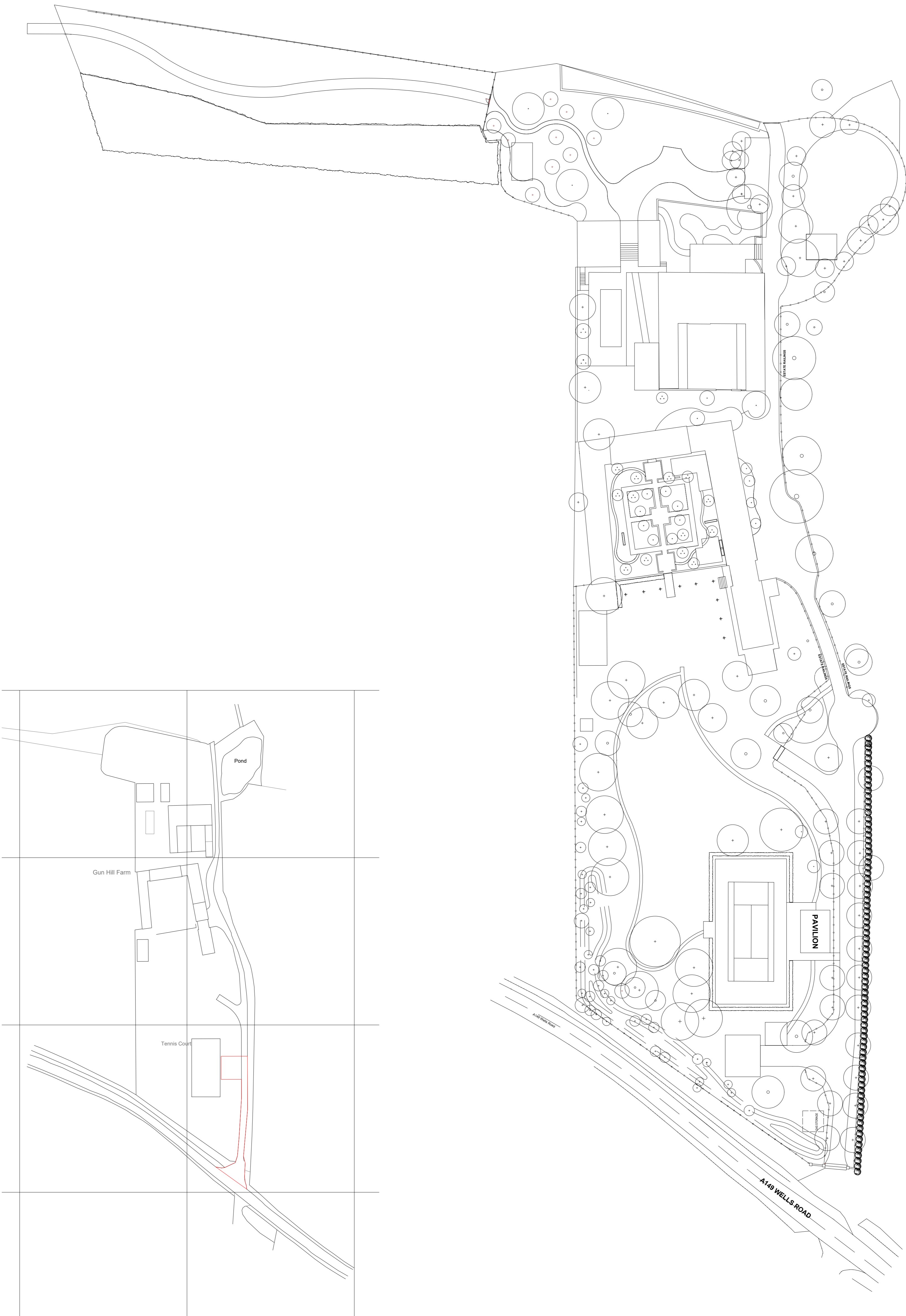
Location plan 1:1250