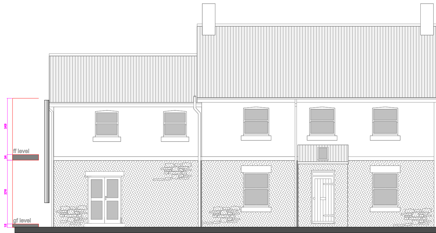
front - south - elevation