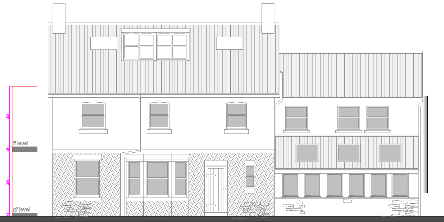
rear - north - elevation