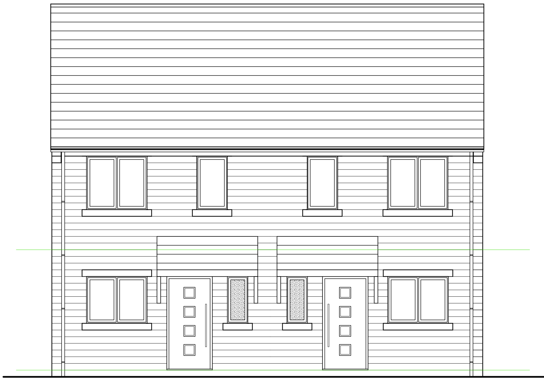
PROPOSED FRONT ELEVATIONS