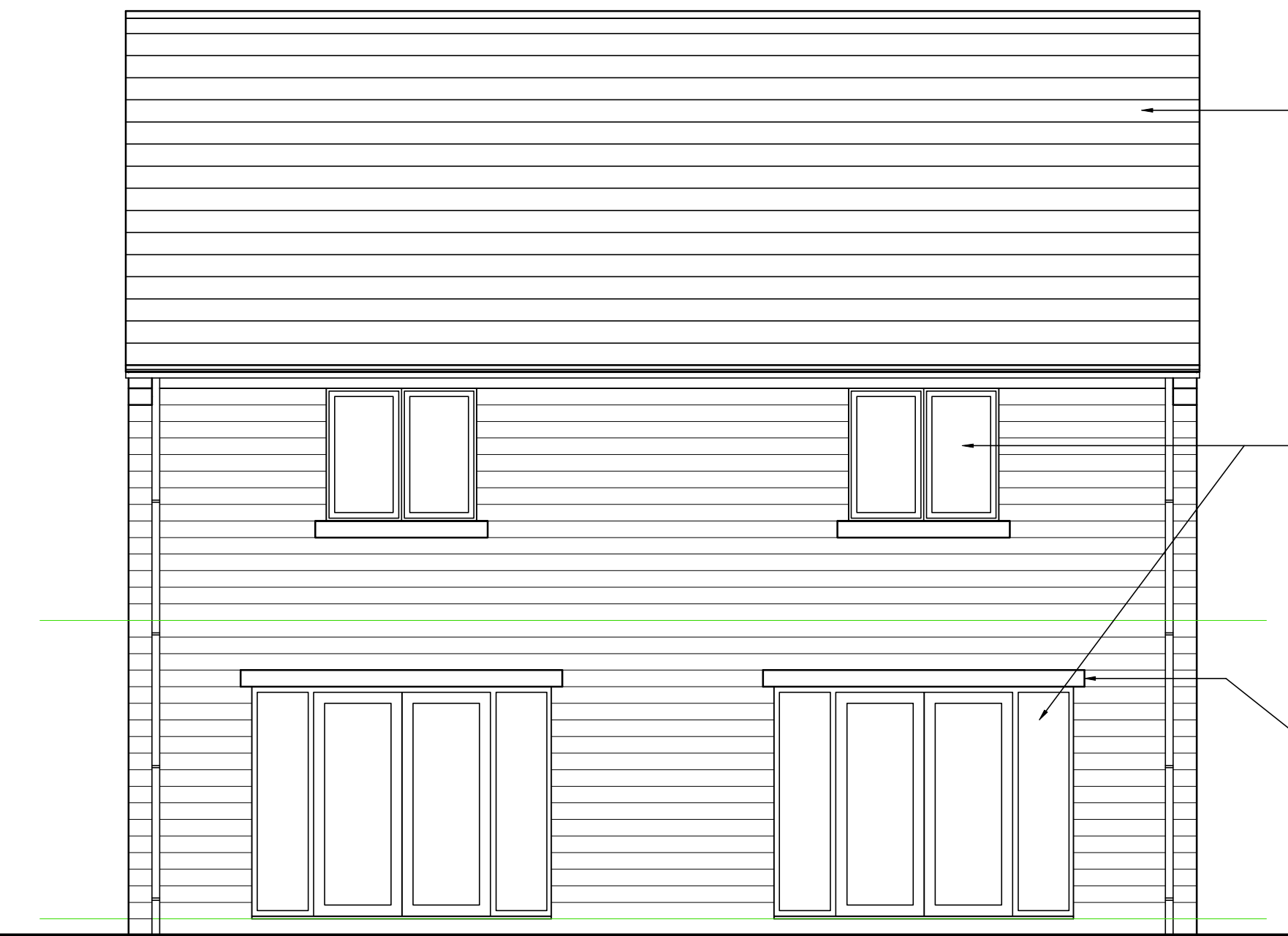
PROPOSED REAR ELEVATIONS