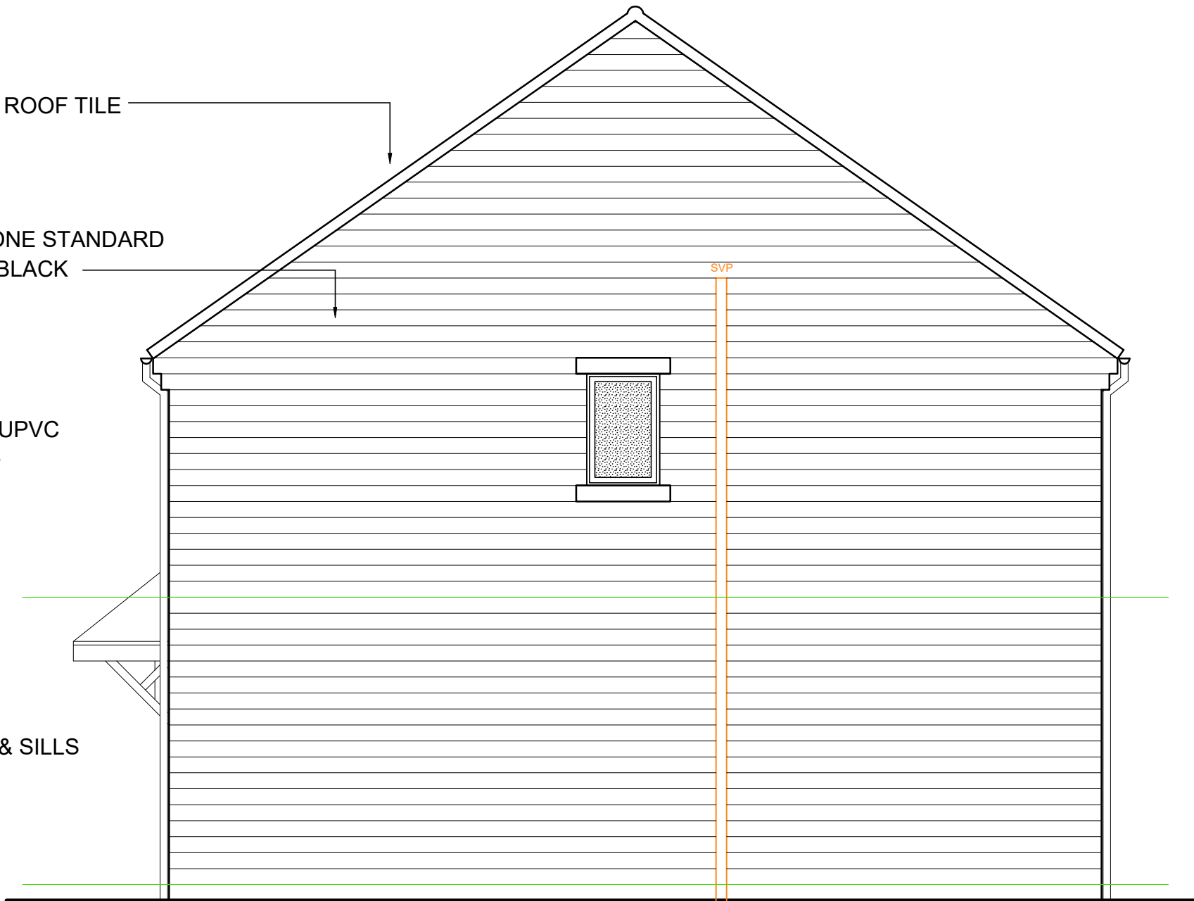
PROPOSED SIDE ELEVATIONS