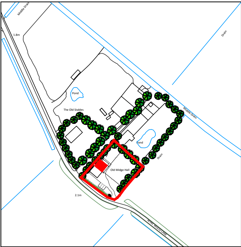
LOCATION PLAN SCALE 1:2500