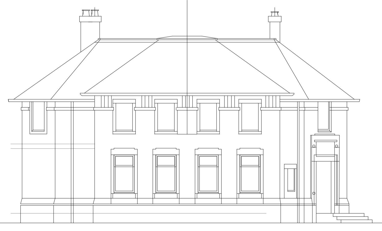
1:100 West Facing Elevation As Existing