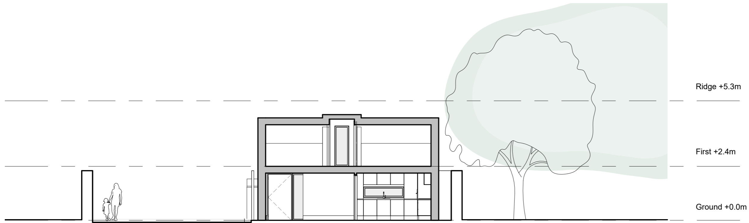
Long Section Looking West