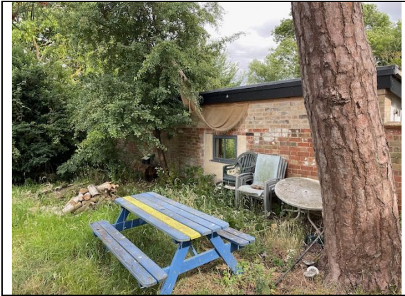
Principal North Elevation