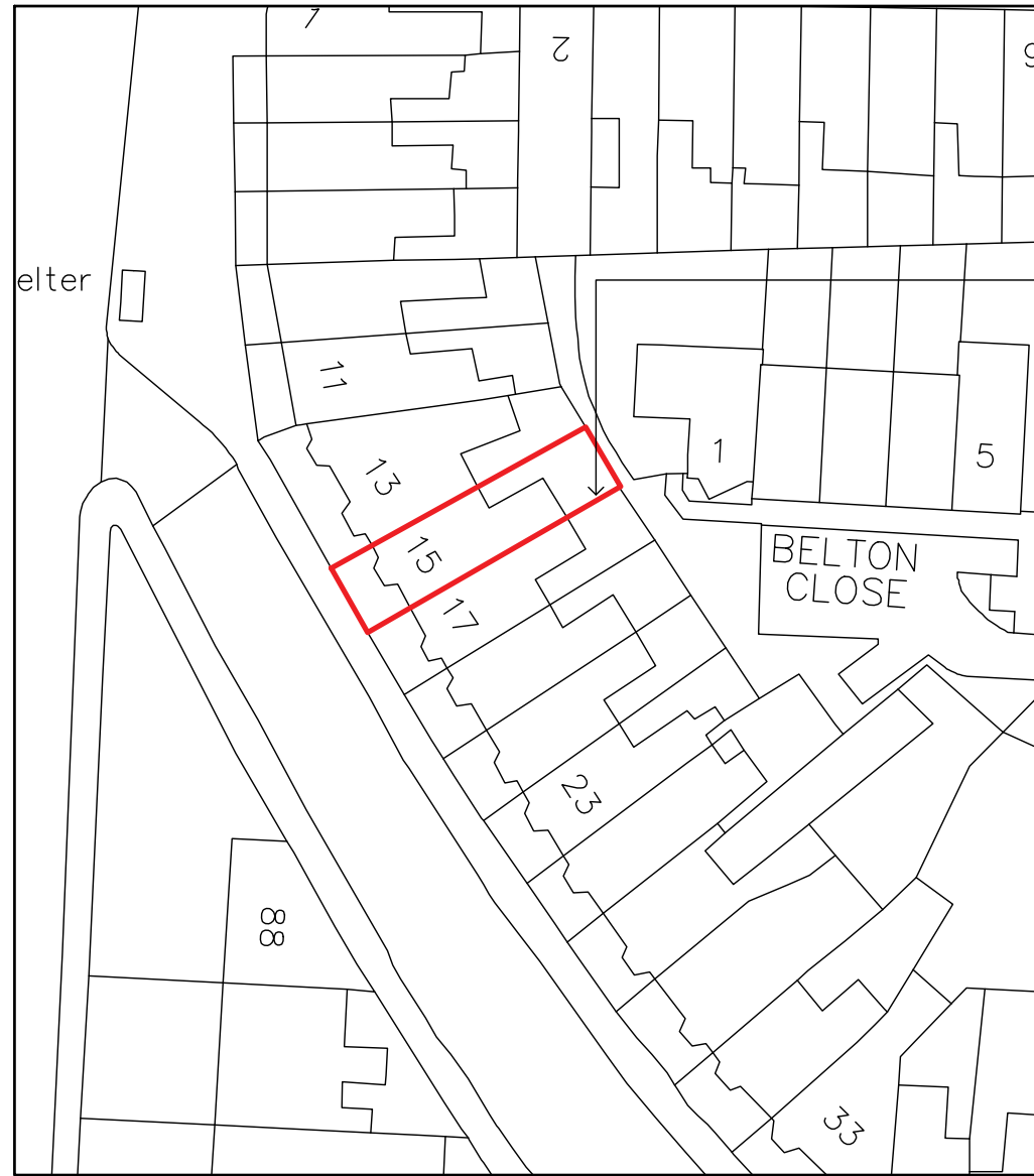
Block Plan @ 1:500