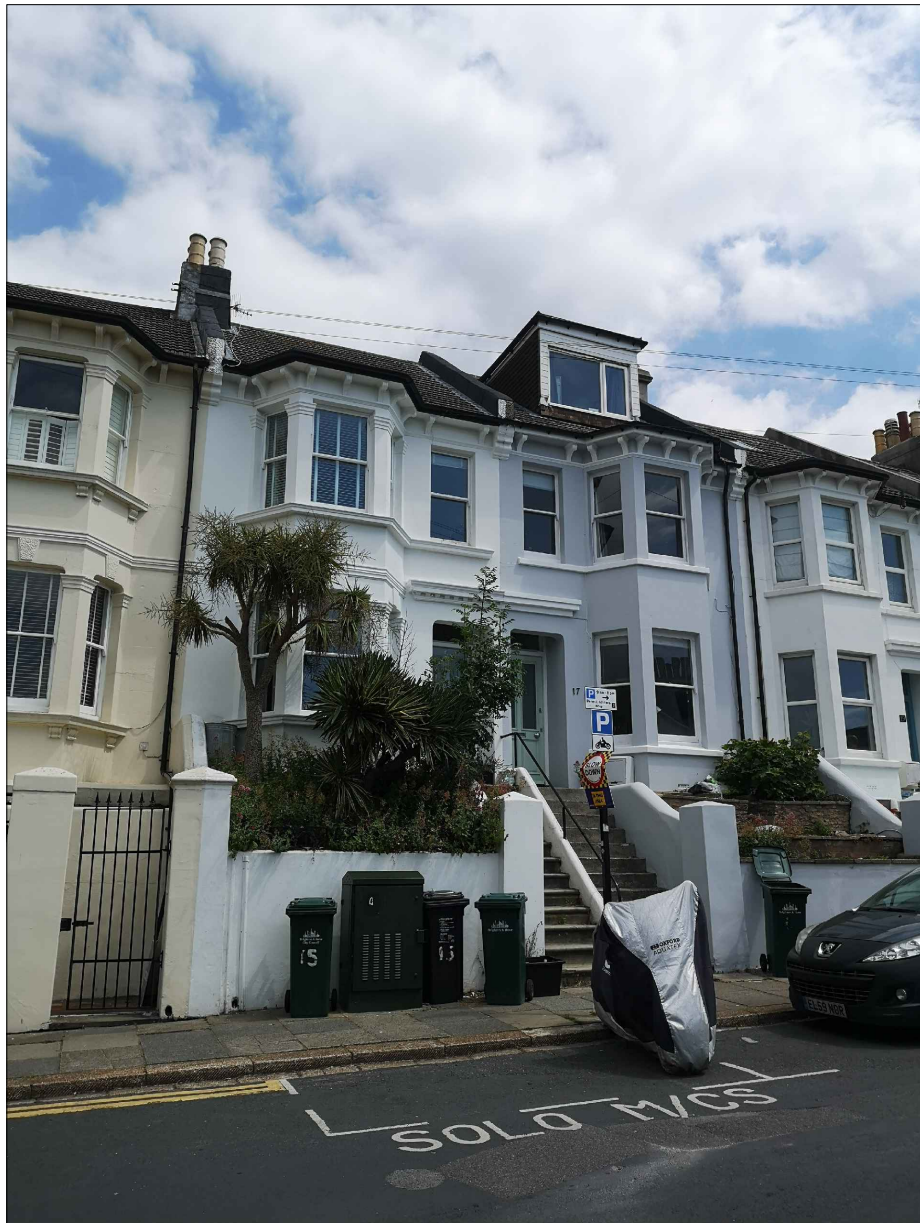
PHOTO 1 - Front elevation of 15 Prince's Crescent