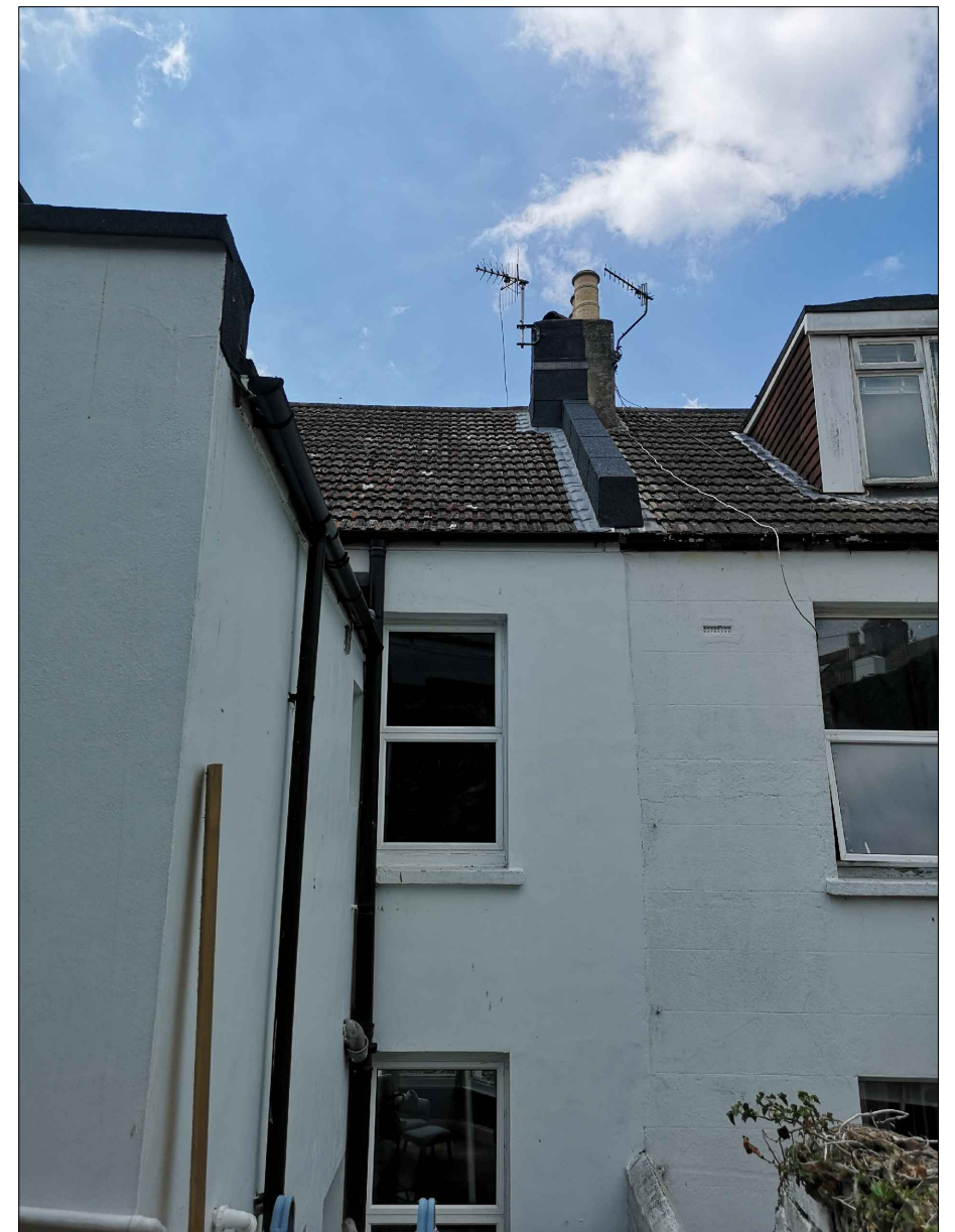
PHOTO 3 - Rear elevation of 15 Prince's Crescent (no.13 to the right)