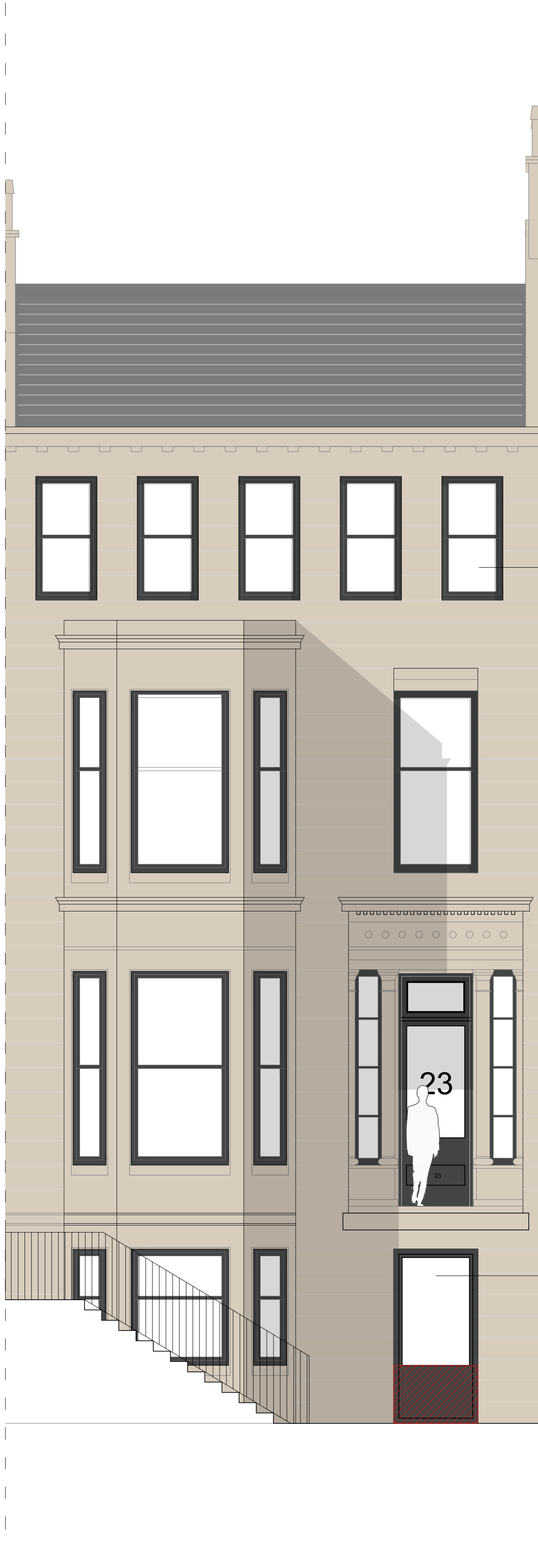
ELEVATION TO ATHOLE GARDENS