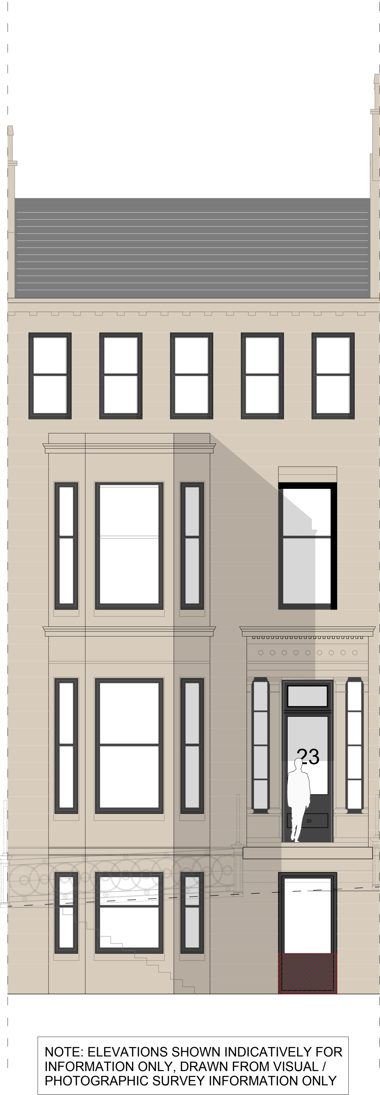
ELEVATION TO ATHOLE GARDENS

New Replacement Double Glazed Sash & Case Windows to ALL existing windows: - All windows to be replaced - New windows to match assumed original configuration in all aspects of design, proportions, profile, framing thickness, detailing, method of opening and materials as far as Reasonably Practicable. - New windows to meet the requirements of Current Technical Standards as far as Reasonably Practicable (with deference to Listed Status of Building) - Windows to be double glazed and achieve a U-Value of 1.4 W/m2k. - White Painted Finish Internally and Externally. - New Sand Mastic to be Applied Externally.