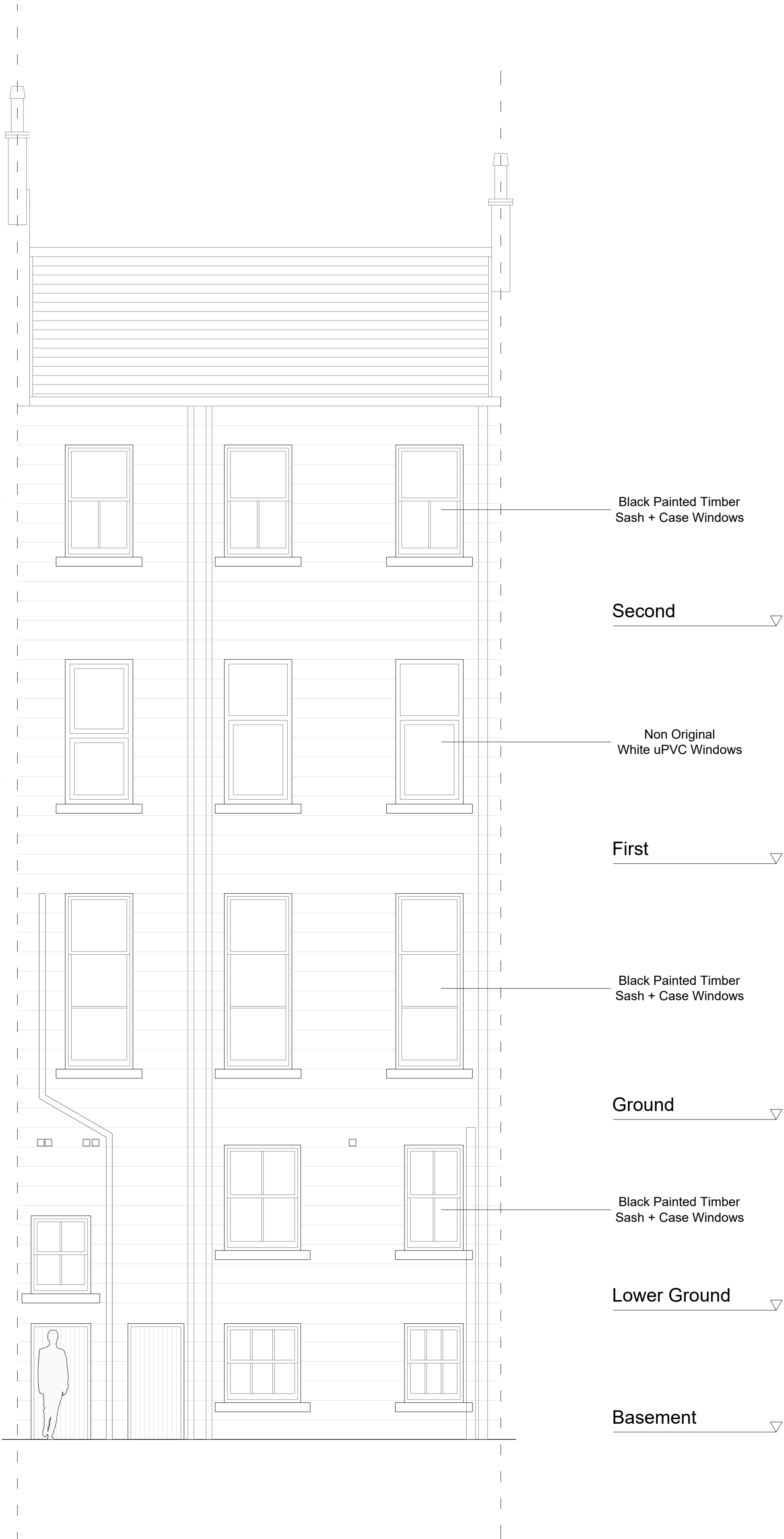
ELEVATION TO VICTORIA CRESCENT LANE