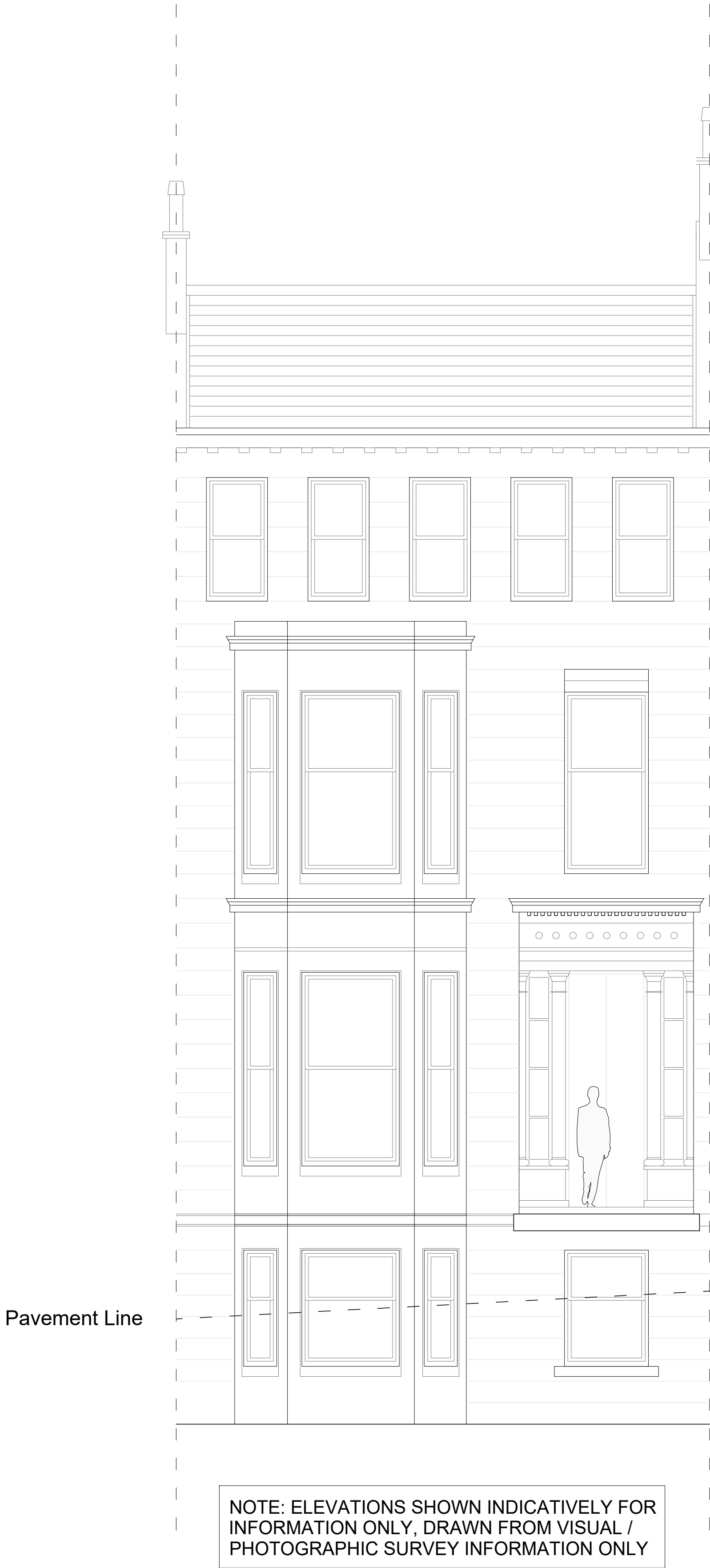
ELEVATION TO ATHOLE GARDENS

If in any doubt regarding the information contained on drawing, consult with Architect at earliest opportunity.