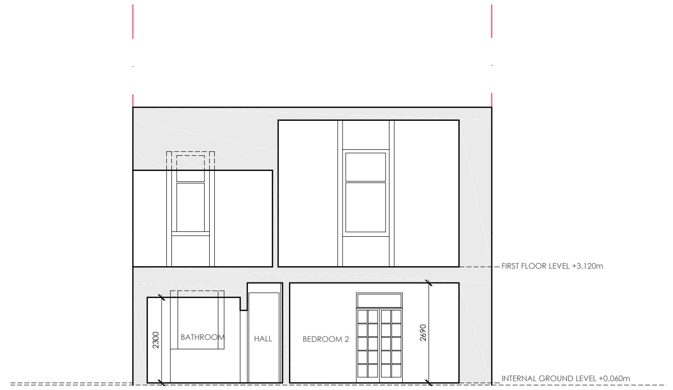
SECTION CC AS EXISTING