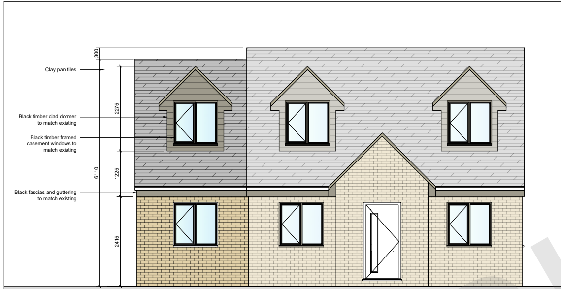
Proposed Front Elevation Scale 1:50