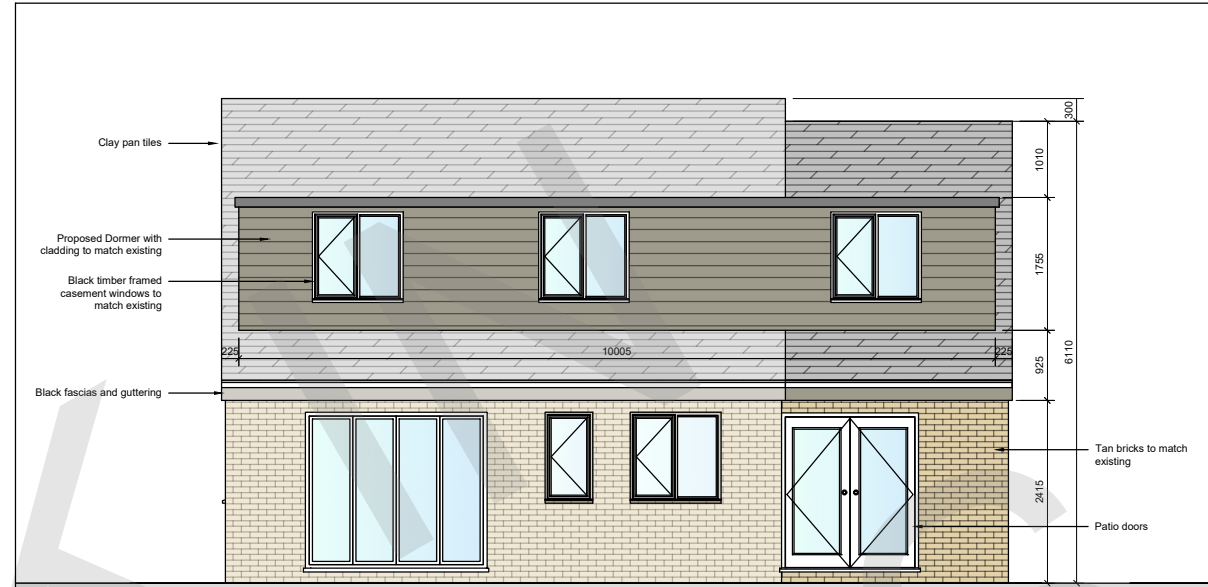
Proposed Rear Elevation Scale 1:50