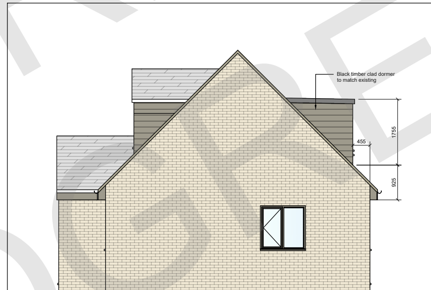
Proposed North Side Elevation Scale 1:50

Disclaimer PLANNING DRAWINGS All drawings are provided for planning purposes only. Drawings have been created from a non-intrusive survey and all dimensions must be checked on site before any work commences. If in doubt please contact the main contractor if one has been appointed. No responsibility can be taken with from any errors when measuring off this drawing.