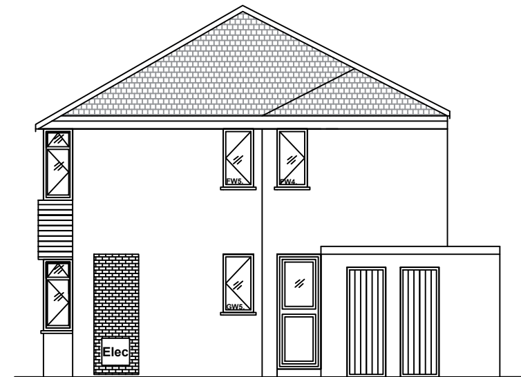
Proposed Side Elevation North Elevation