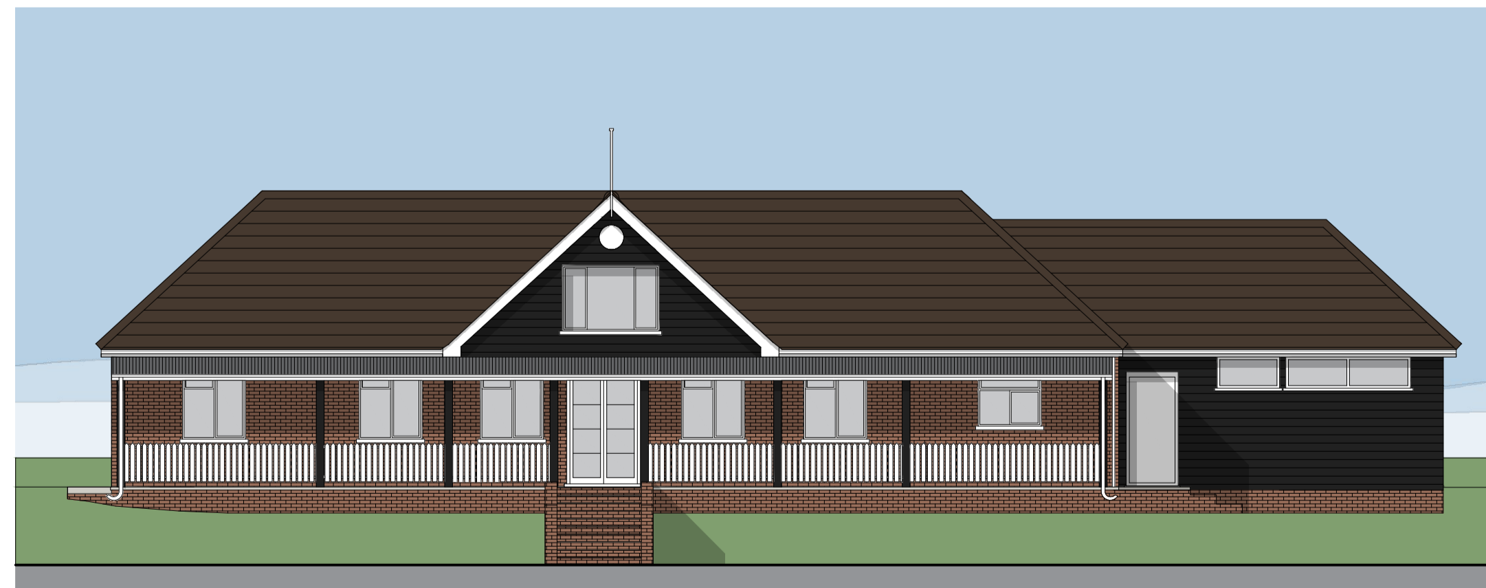
EXISTING EAST ELEVATION SCALE 1:100