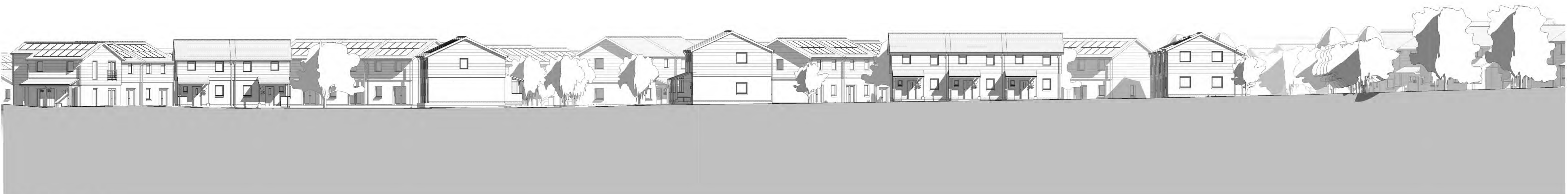
Section J - J 1 : 200