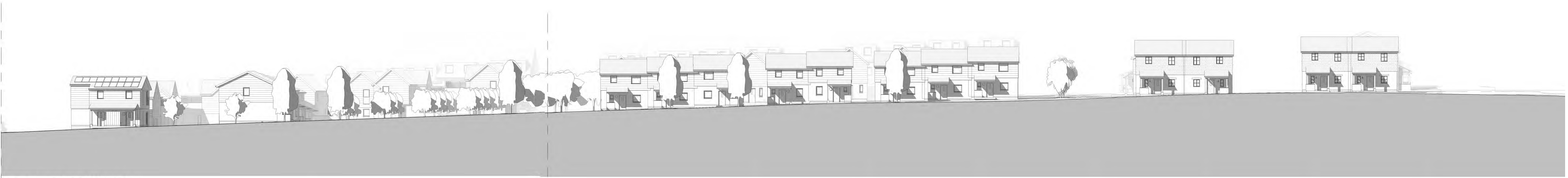
Section C - C (Part 2) 1 : 200