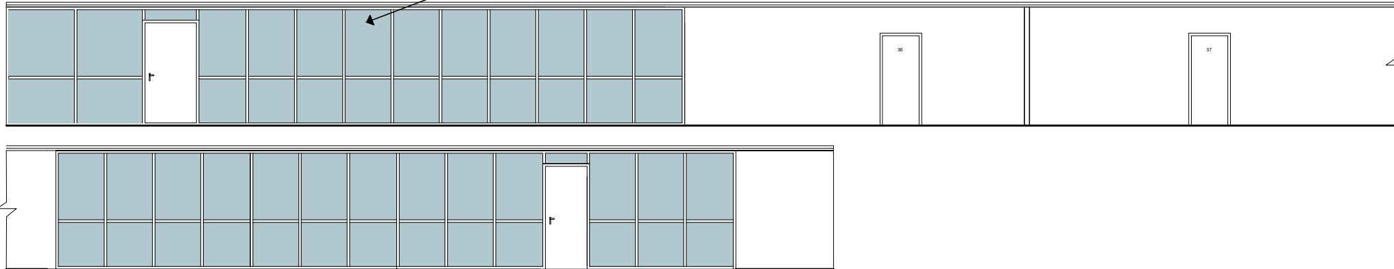
Existing Sectional Elevation B SCALE 1:100 @ A3

Aluminium frame with toughened obscured glazed screen