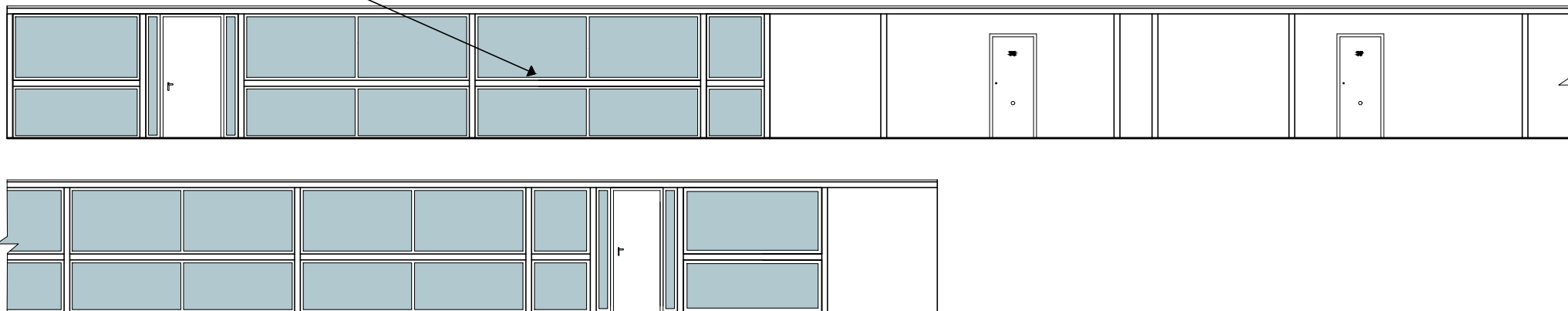
Proposed Sectional Elevation B SCALE 1:100 @ A3

Aluminium frame with toughened obscured glazed screen