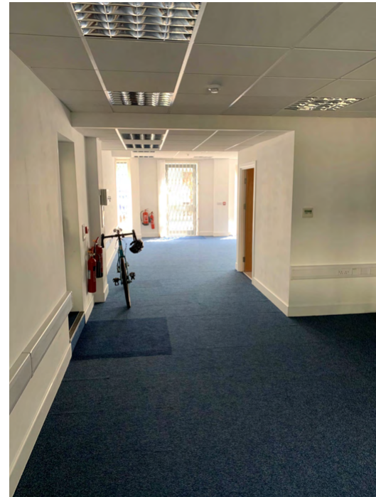
Interior - looking towards front elevation