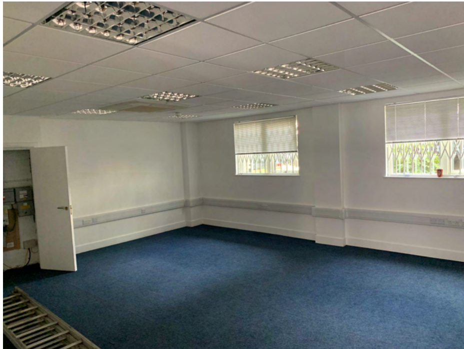
Interior - looking towards the rear elevation