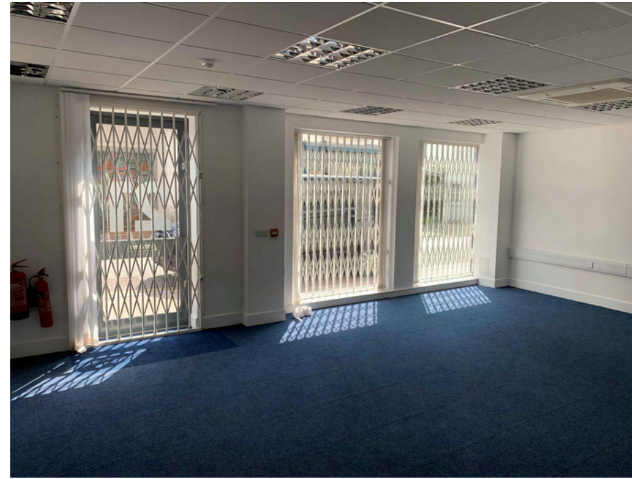
Interior - looking towards front elevation