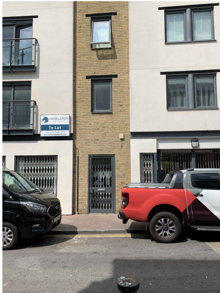
Middle Street - Front Elevation and Side Access