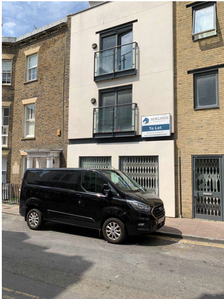
Middle Street - Front Elevation