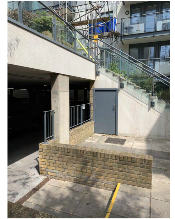
Area for proposed cycle storage

4 Gloucester Passage, Brighton BN1 4AS e: studio@sticklandwright.co.uk t: 01273 964051 Company registered in England No. 11222477