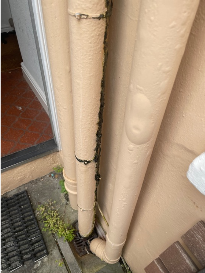
Fig. 2 Rear elevation