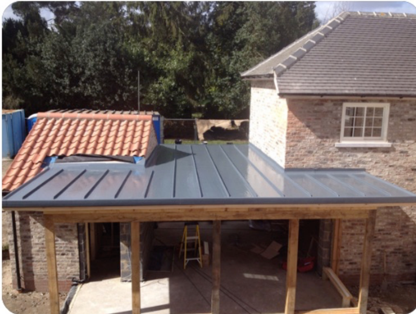
Fig. 1: Single ply membrane