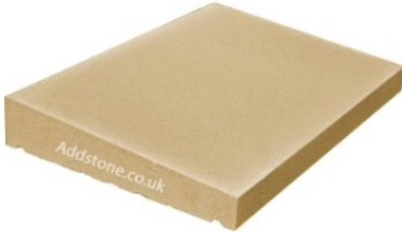
Fig. 4 Once weathered cast stone coping

c) The proposed proposed copings to the parapets are cast Bath Stone. See Fig. 4 and 5.