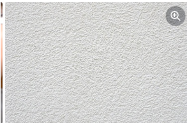
Fig. 3 Smooth sand cement render