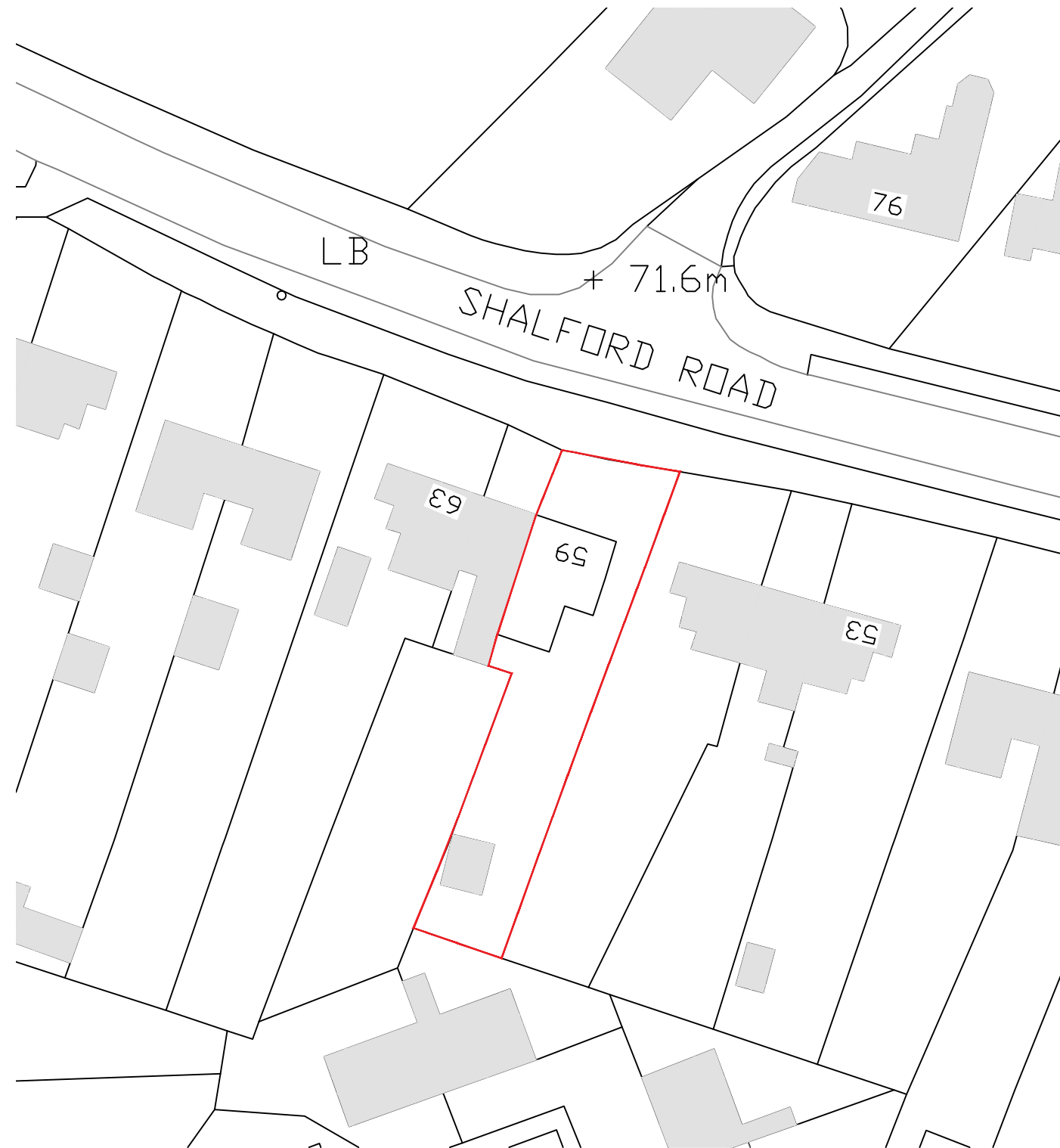
Block Plan (Proposed) Scale 1:500