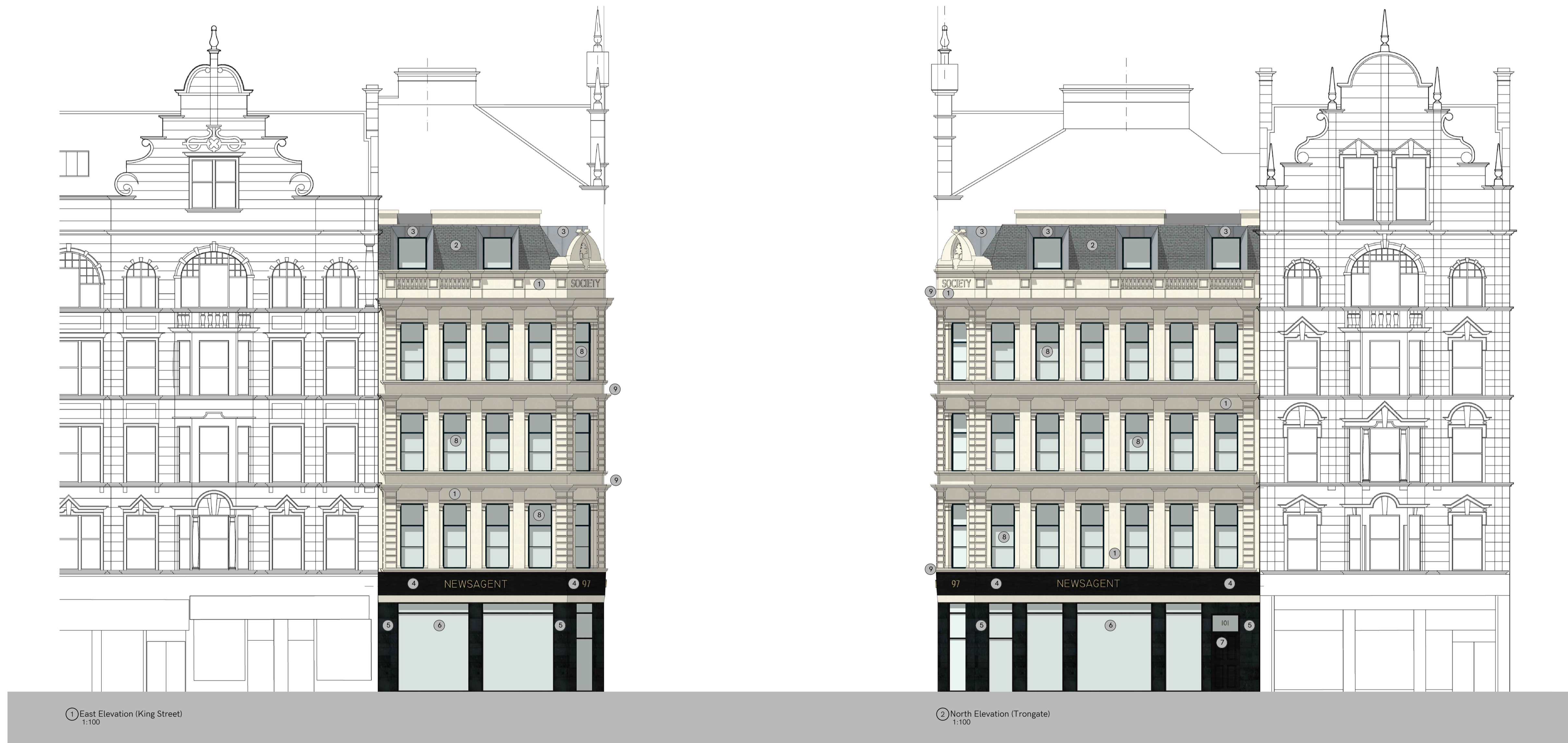
1 East Elevation (King Street) 1:100

Notes Copyright and not to be reproduced without the consent of Holmes Miller. Holmes Miller accepts responsibility for this document only to the commissioning Party and not to any other. Holmes Miller does not accept liability for accuracy or veracity of survey information provided by others and horizontal dimensions and levels provided by Holmes Miller and based on survey information provided by others must be verified on site. DO NOT SCALE. Use figured dimensions only.