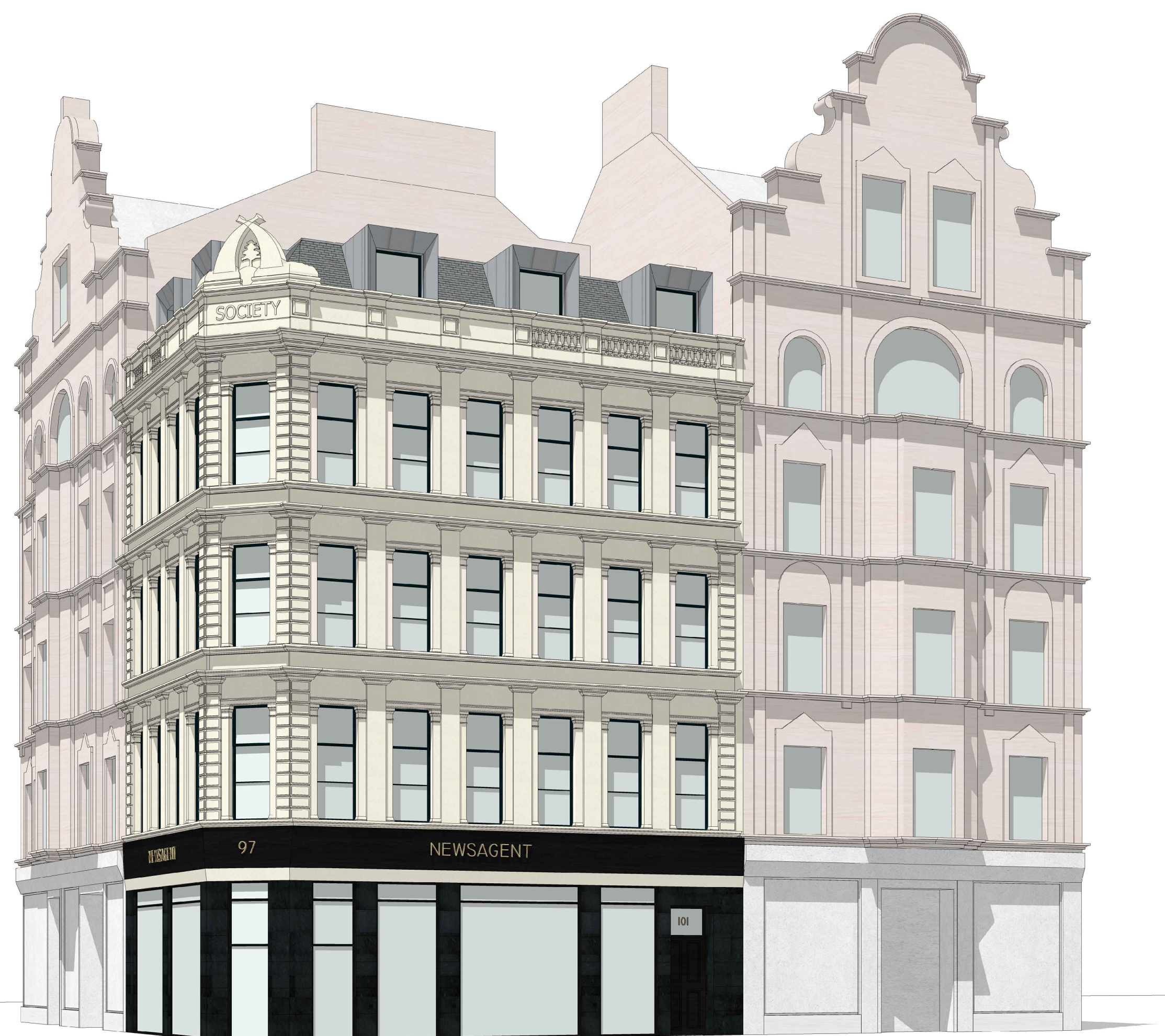
① Street Level View of Corner 1:100

Notes Copyright and not to be reproduced without the consent of Holmes Miller. Holmes Miller accepts responsibility for this document only to the commissioning Party and not to any other. Holmes Miller does not accept liability for accuracy or veracity of survey information provided by others and horizontal dimensions and levels provided by Holmes Miller and based on survey information provided by others must be verified on site. DO NOT SCALE. Use figured dimensions only.