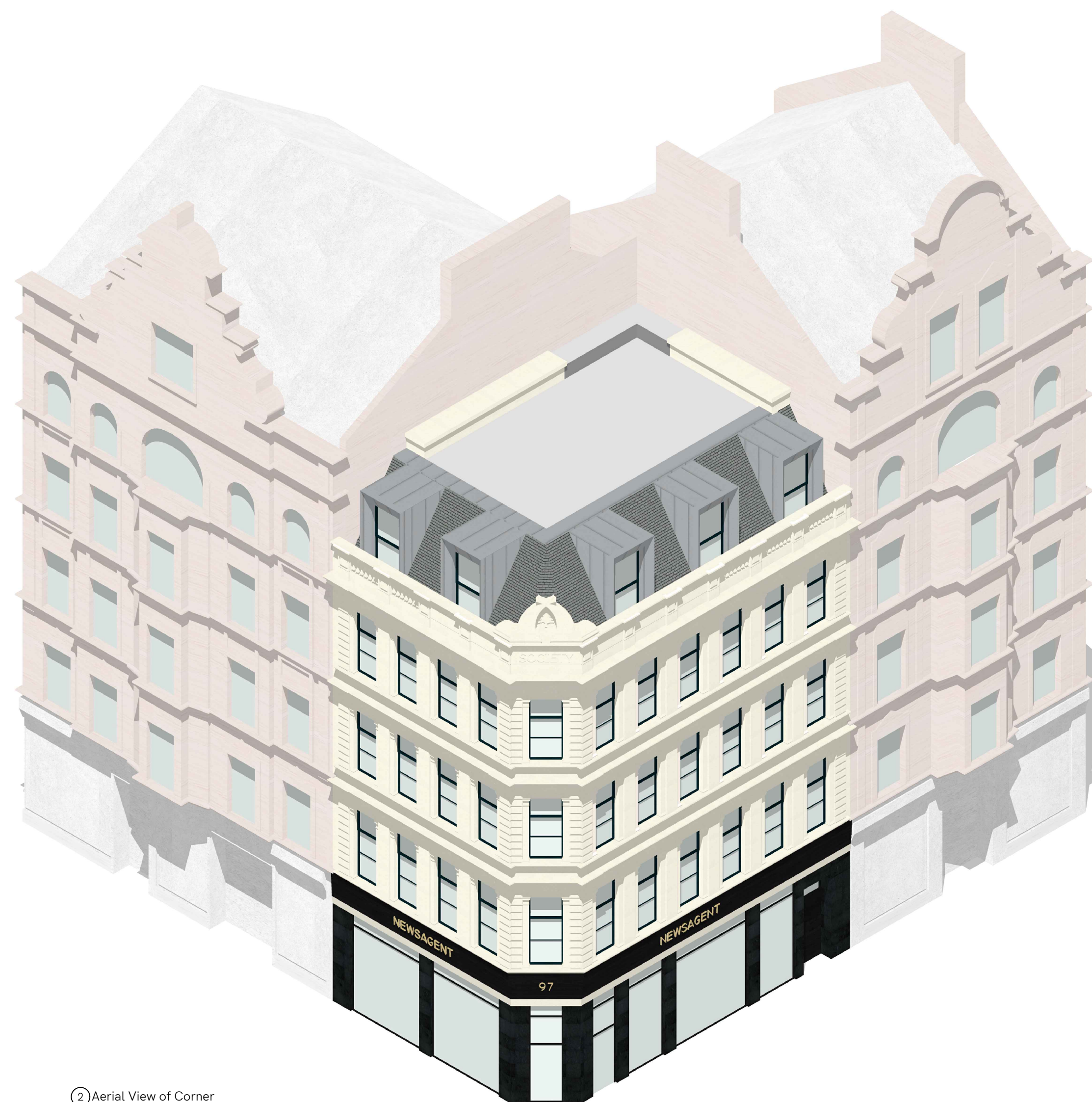
② Aerial View of Corner 1:100