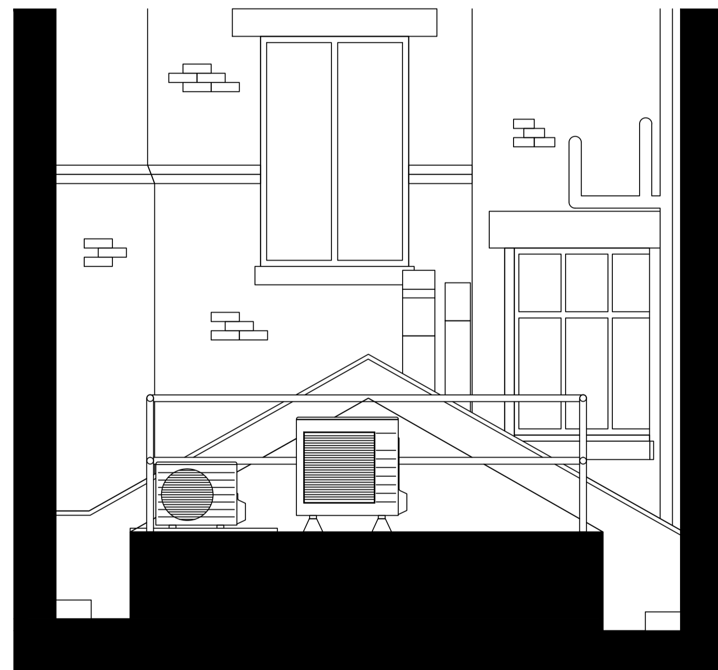
Existing Elevation A-A