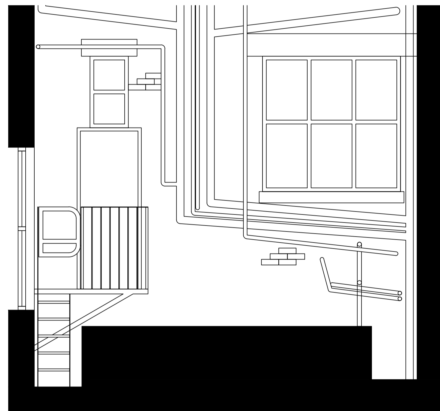
Existing Elevation C-C