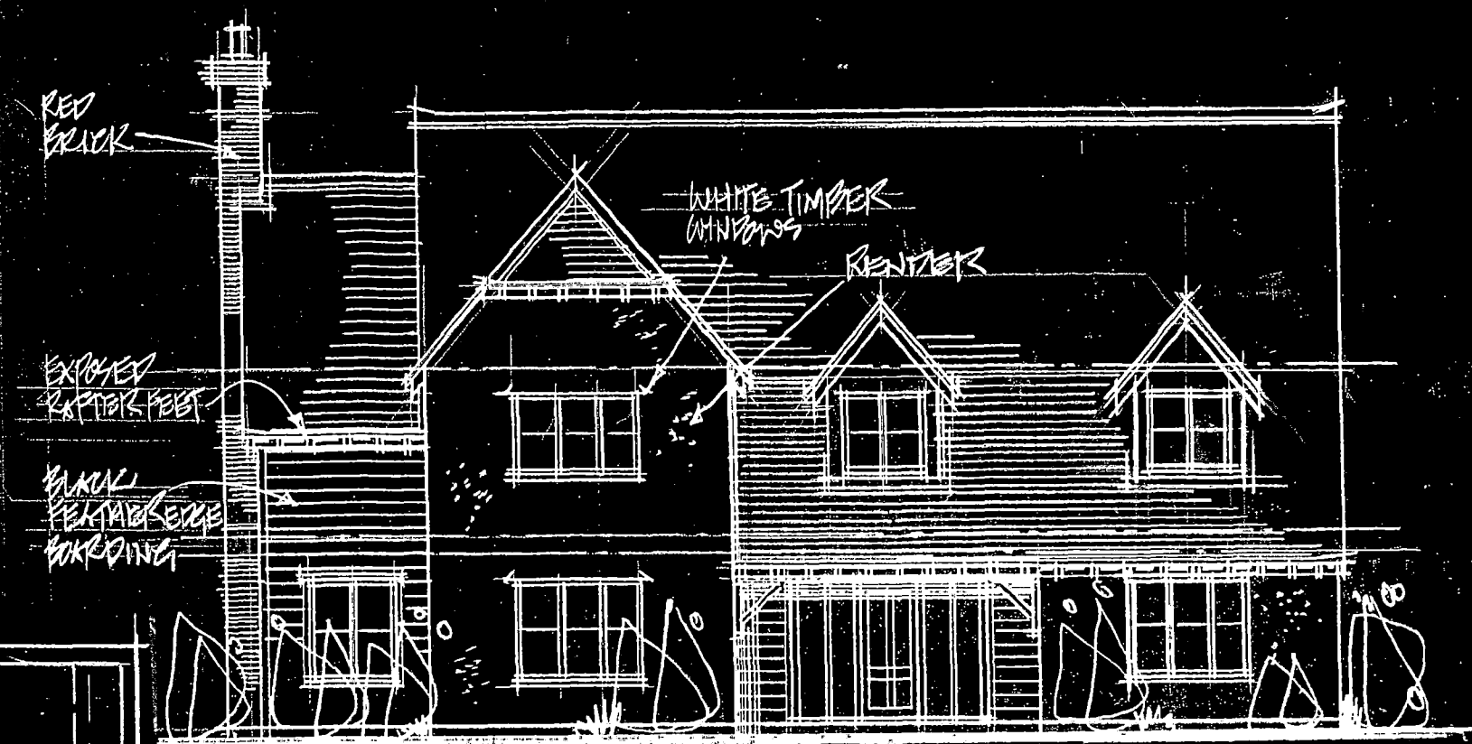
FRONT ELEVATION (NORTH) 1:100