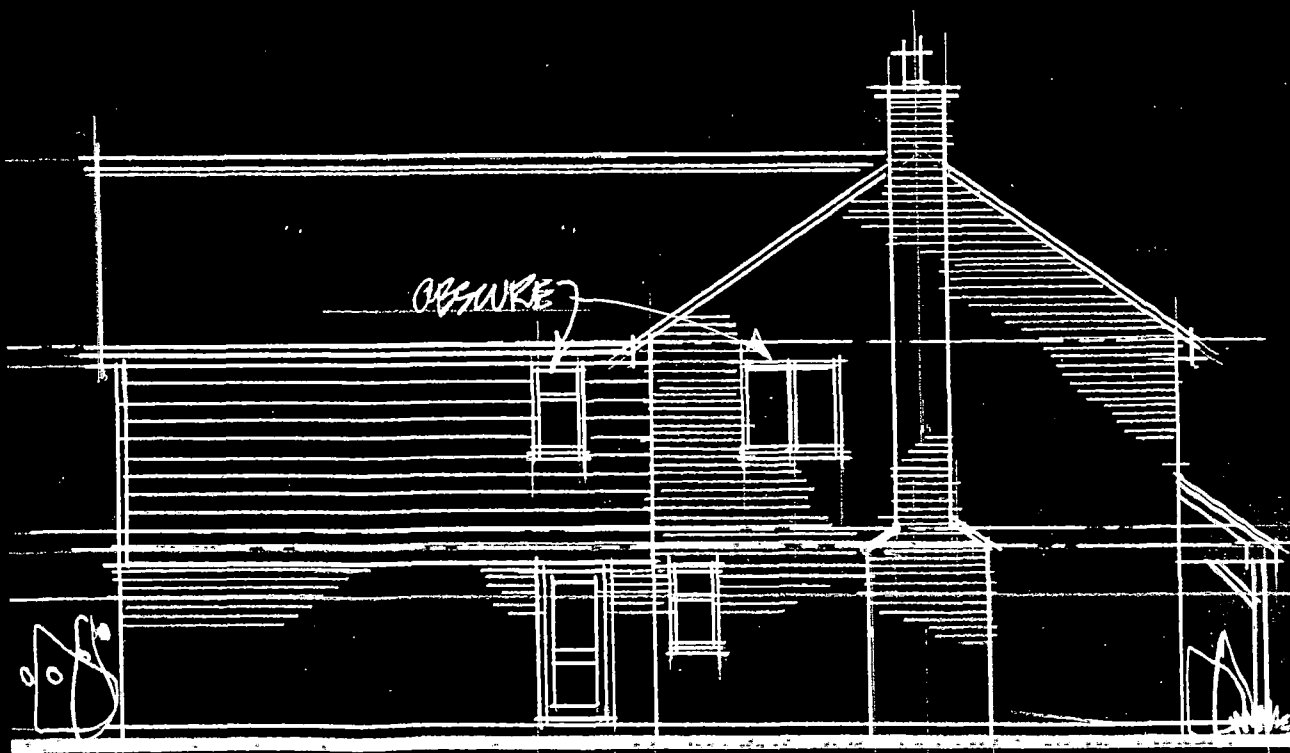
LEFT SIDE (NORTH)