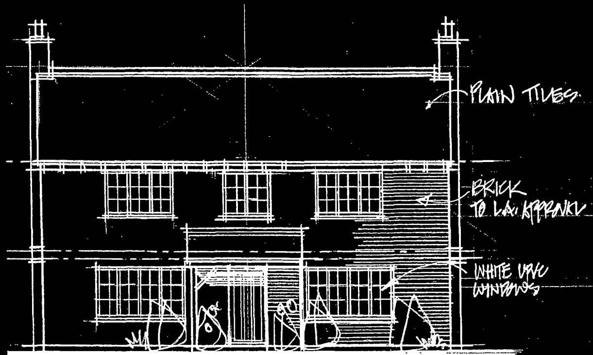
FRONT ELEVATION (WEST)