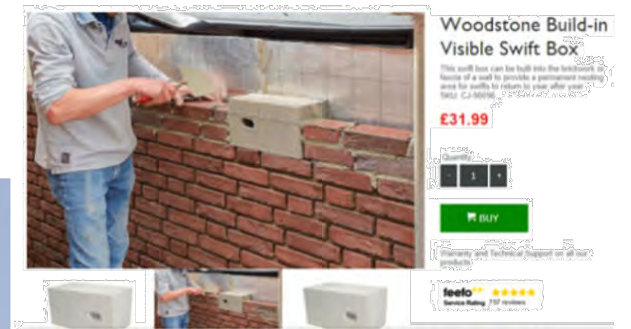
6no. Swift Boxes built into external wall under eaves: Woodstone Build-in Visible Swift Box