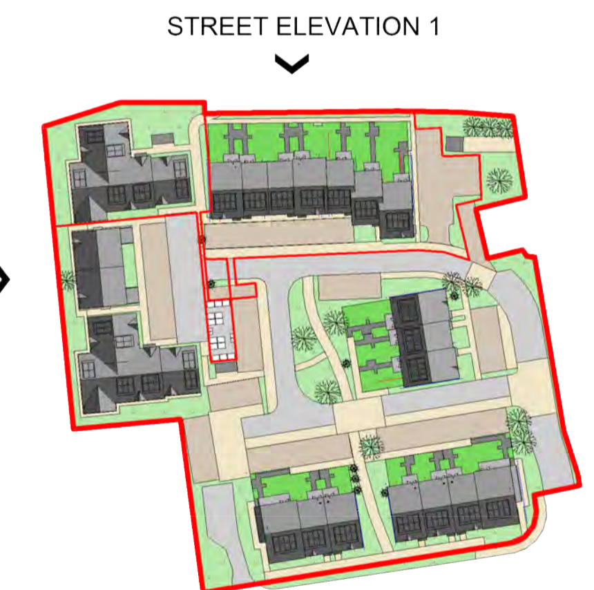
STREET ELEVATIONS KEY

REFER TO MATERIALS SCHEDULE FOR DETAILS OF FINISHES