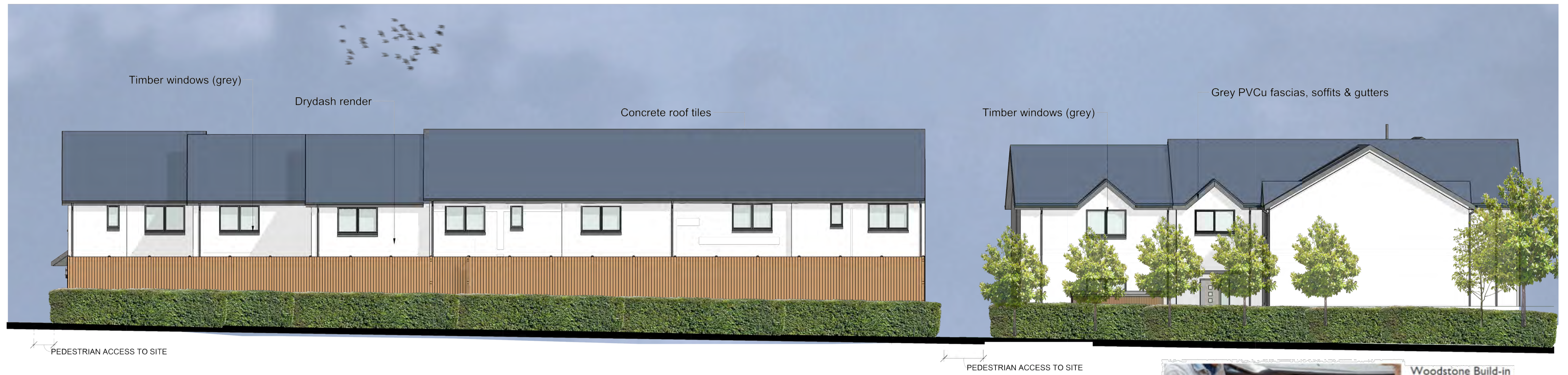
STREET ELEVATION 1 SCALE: 1 : 100