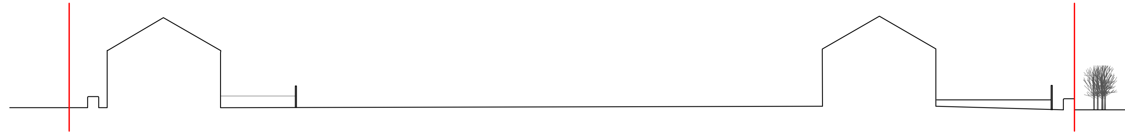
SITE SECTION A-A SCALE: 1:200