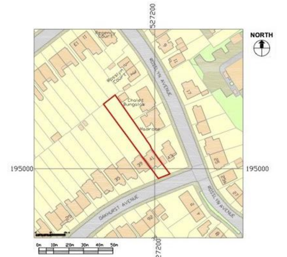
01 LOCATION PLAN 1:1250 LEGEND Application Site, 41 Oakhurst Avenue, London, EN4 8DL