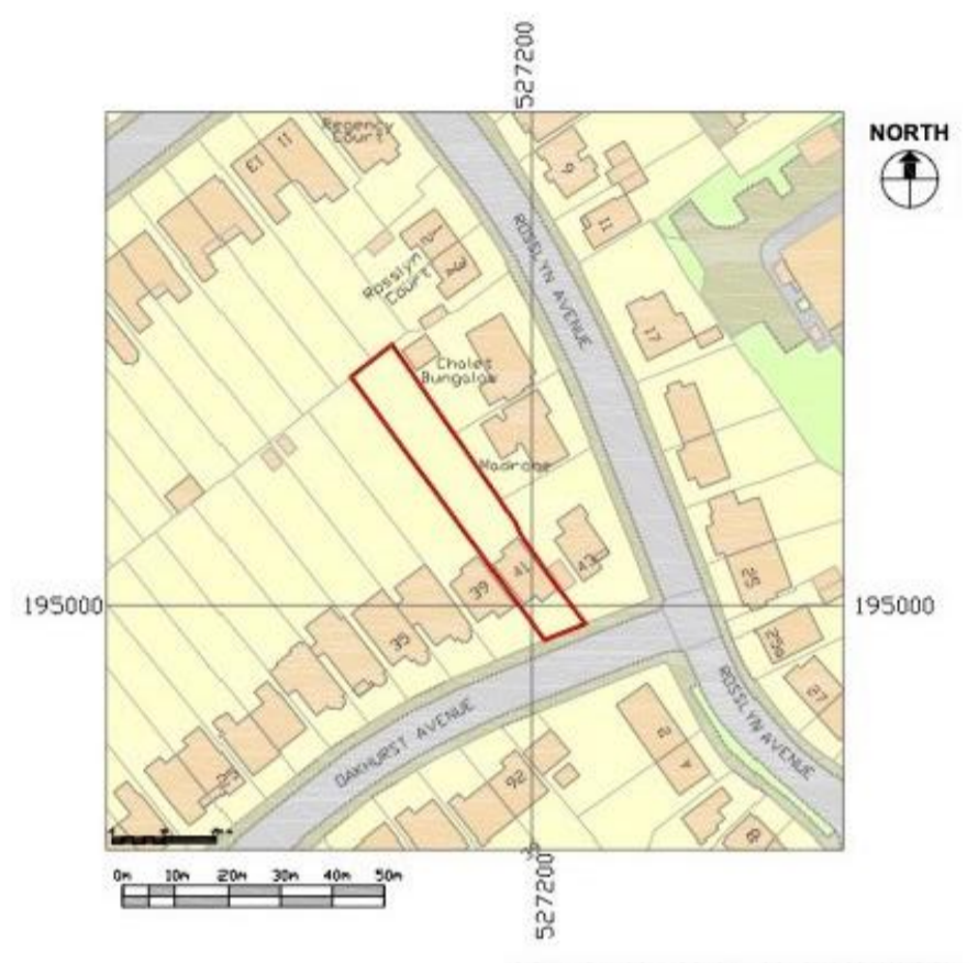
01 LOCATION PLAN 1:1,250 LEGEND Application Site, 41 Oakhurst Avenue, London, EN4 8DL