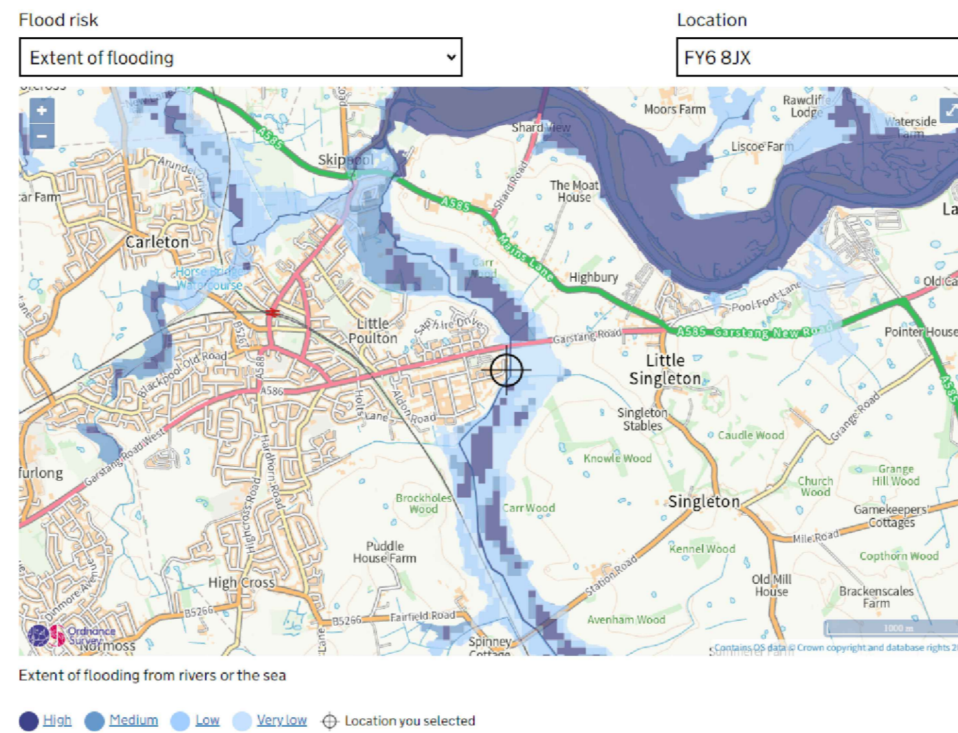
Extent of Flooding: Rivers of Sea Very Low Risk Classification