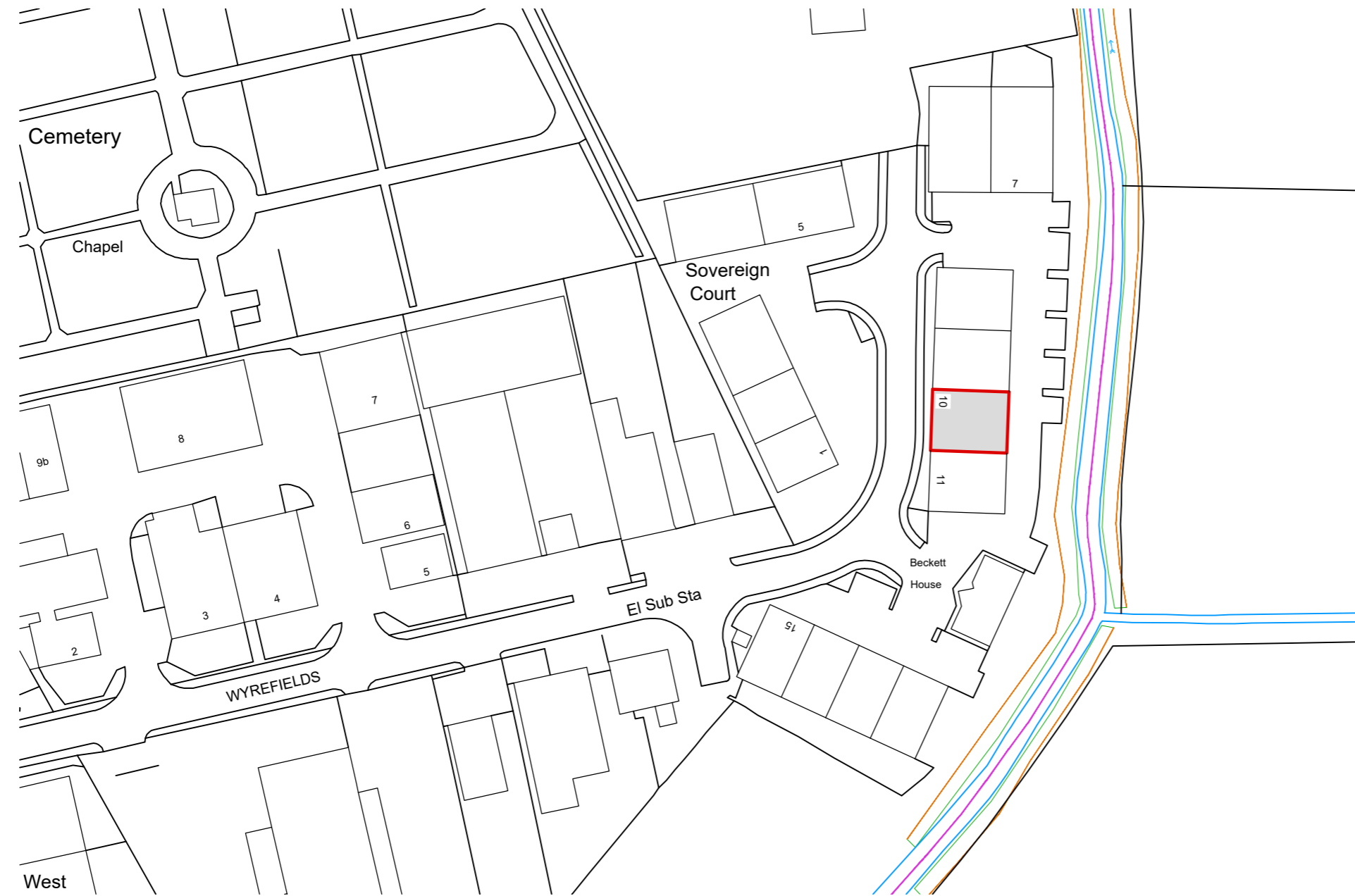
Site Location Plan (1:1250)