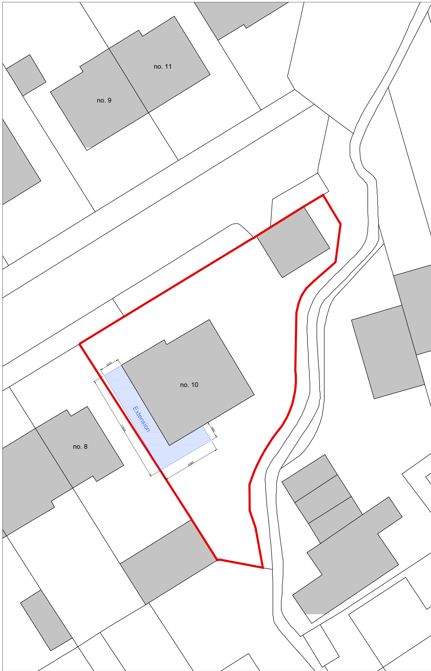
Proposed Ground Floor Block Plan 1:200